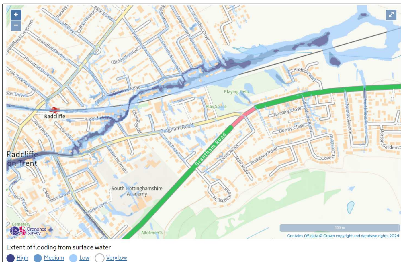
Figure 3: Environment Agency: Surface Water Risk Mapping for Radcliffe on Trent.