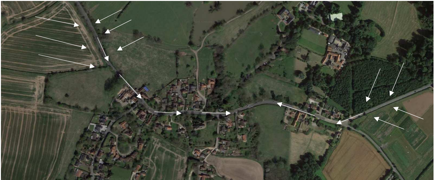
Figure 5: Surface Water flows in Kirklington.

During Storm Babet substantial surface water ran off agricultural land both north and south of the A617, which subsequently flowed down the A617 towards the village. This flow overtopped the highway in areas with low and dropped kerbs resulting in various instance of internal property flooding across Main Street. The flooding was further exacerbated by additional flows from the east of the A617 with further flows from adjacent agricultural land entering the A617. Figure 5 below highlights the flow of surface water during the event.