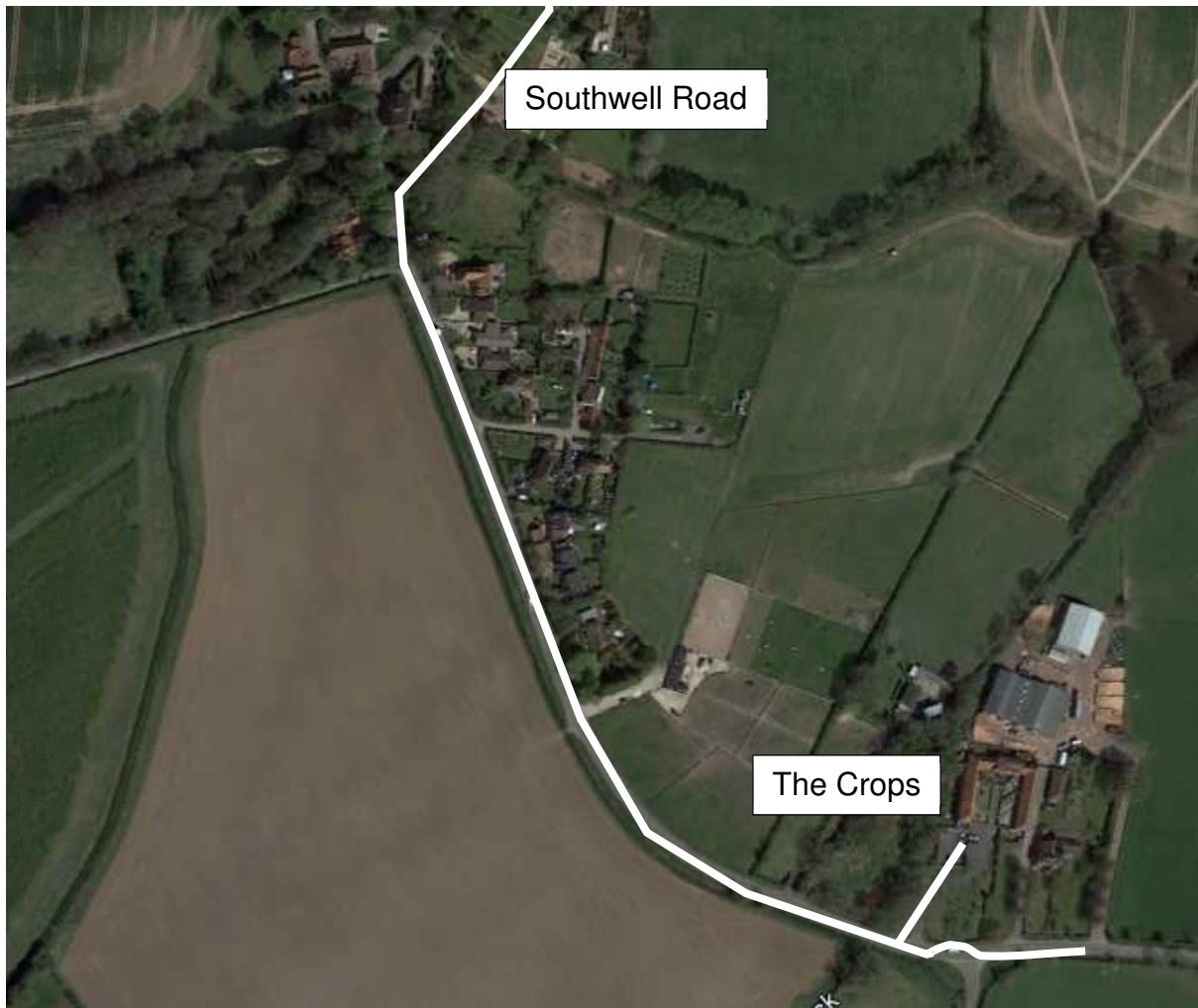
Figure 3: Reference View for affected area in Kirklington: Southwell Road and The Crops.