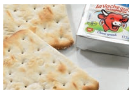
Cheese & crackers Gluten Milk