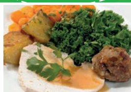
Roast turkey & stuffing Gluten OR VEGETARIAN OPTION Roast Quorn Milk Egg gravy roast OR mashed potatoes cabbage & carrots