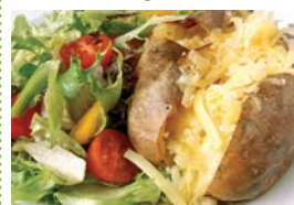
Jacket potato with cheese Milk, baked beans or tuna mayonnaise Egg Fish & mixed salad