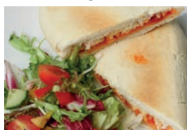
Cheese & tomato panini Gluten Milk Sesame vegetable sticks