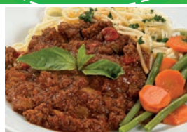
Spaghetti Bolognese Gluten Mustard Soya Fish OR VEGETARIAN OPTION Meatfree Bolognese Gluten Soya Mustard garlic bread Gluten Milk Soya crunchy vegetables