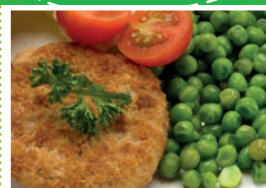
MSC fish cake Gluten Fish OR VEGETARIAN OPTION Fishless fingers Gluten diced potatoes garden peas & crunchy veg, tomato ketchup