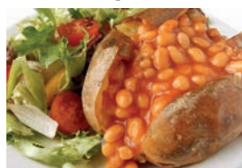
Jacket potato with cheese Milk, baked beans or tuna mayonnaise Egg Fish & mixed salad