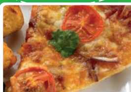
Margherita pizza Gluten Milk Soya pommes noisette vegetable sticks