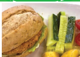
Southern style burger in a bun Gluten Egg Milk Sesame jacket wedges carrot sticks & ranch salad Egg