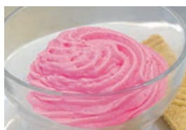
Mixed berry mousse Milk & apple wedge