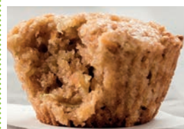
Apple muffin Gluten Egg