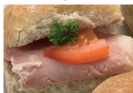
Fresh bread roll Gluten Sesame with hot roast turkey & stuffing Gluten, cheese Milk, ham or tuna mayonnaise Egg Fish roast potatoes, carrot & cucumber sticks