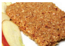
Fruit flapjack Gluten