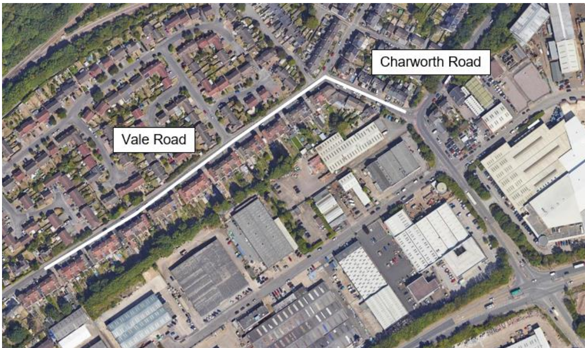
Figure 3. View of Vale Road and Charworth Road.