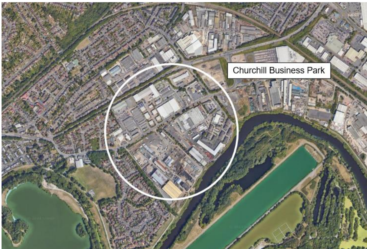
Figure 4. View of Main Street.