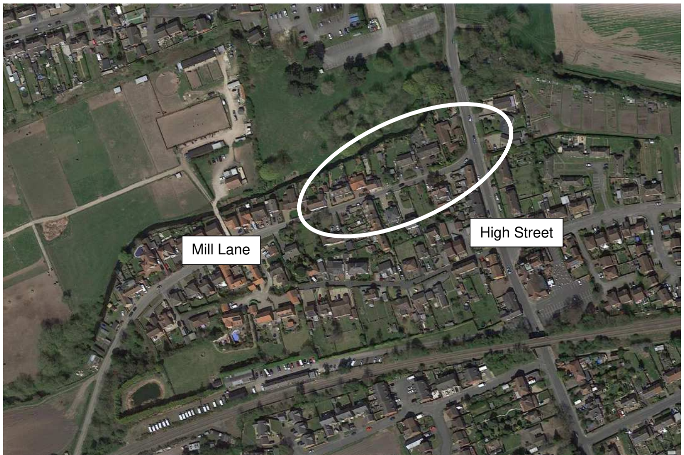
Figure 2. View of Mill Lane and High Street.