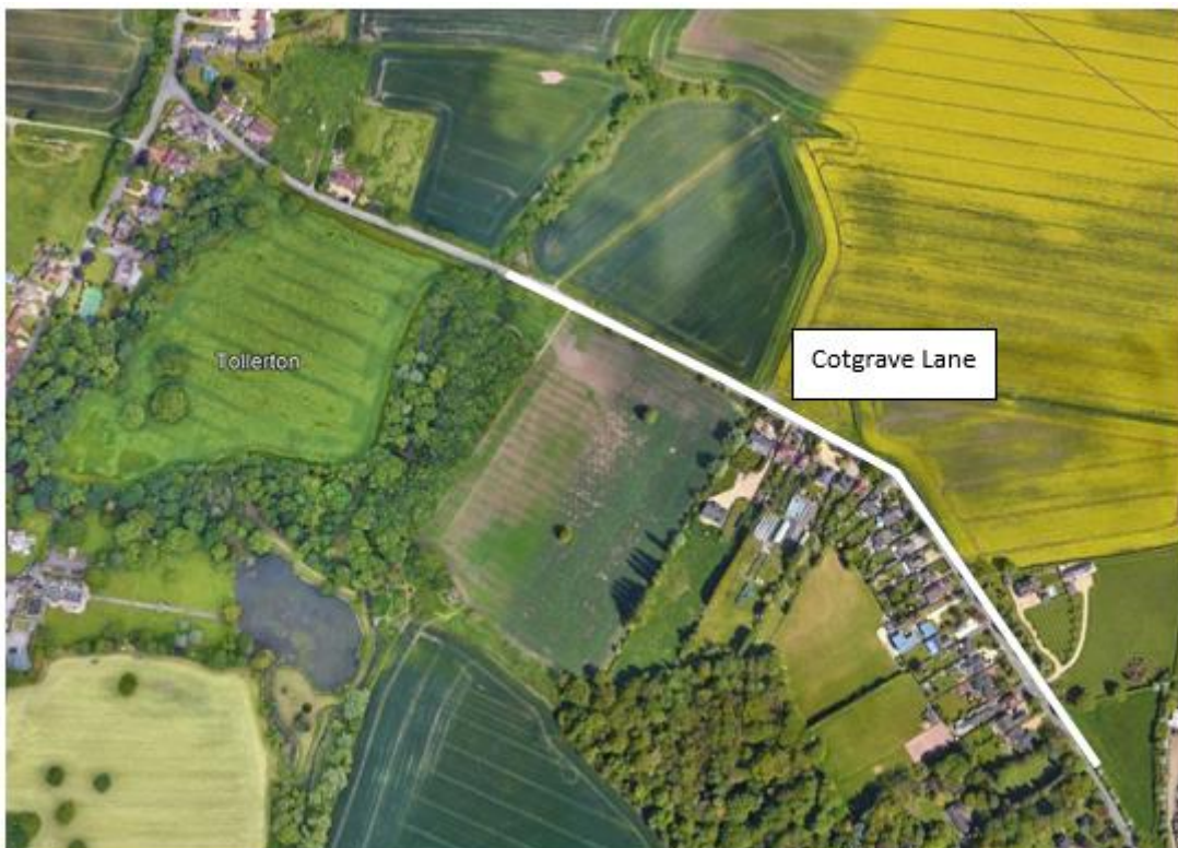
Figure 2. Reference map for flood affected area in Tollerton. Cotgrave Road (5).