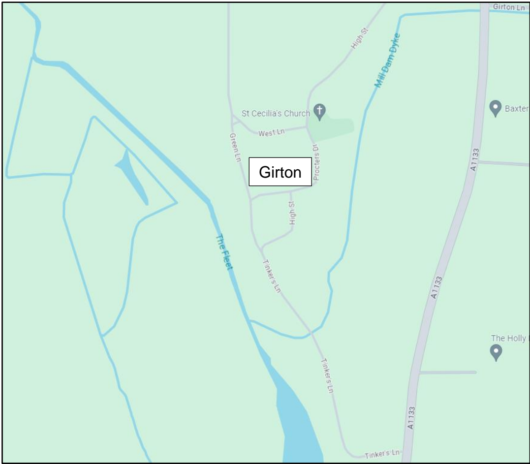
Figure 1. Girton showing its proximity to The Fleet and Mill Dam Dyke.

the River Trent north-west of the village. Figure 1 shows Girton and its proximity to the The Fleet and the Mill Dam Dyke, Figure 2 gives reference to the River Trent.