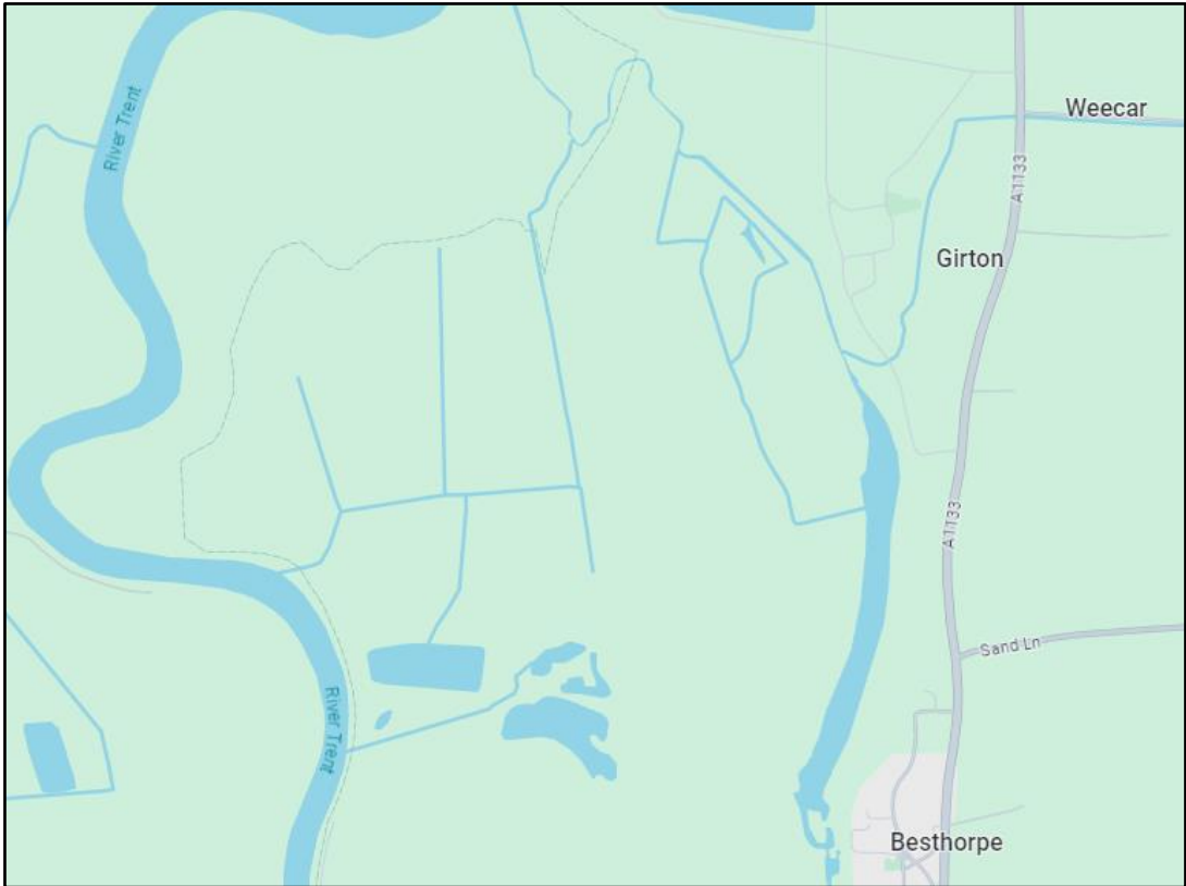
Figure 2. Girton showing its proximity to the River Trent.