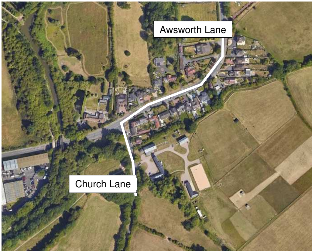
Figure 2: Reference view of affected areas in Cossall.

a) Cossall: Awsworth Lane – 2 properties, Church Lane – 3 properties.