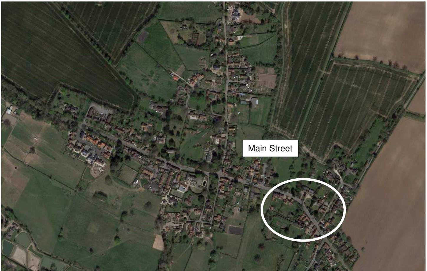
Figure 2. View of Epperstone.