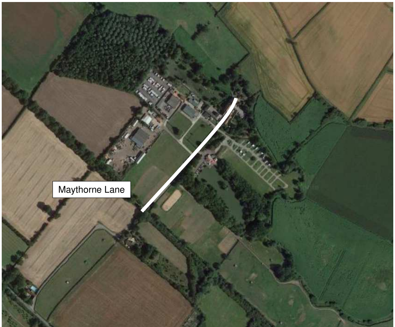
Figure 2. View of Maythorne Lane.