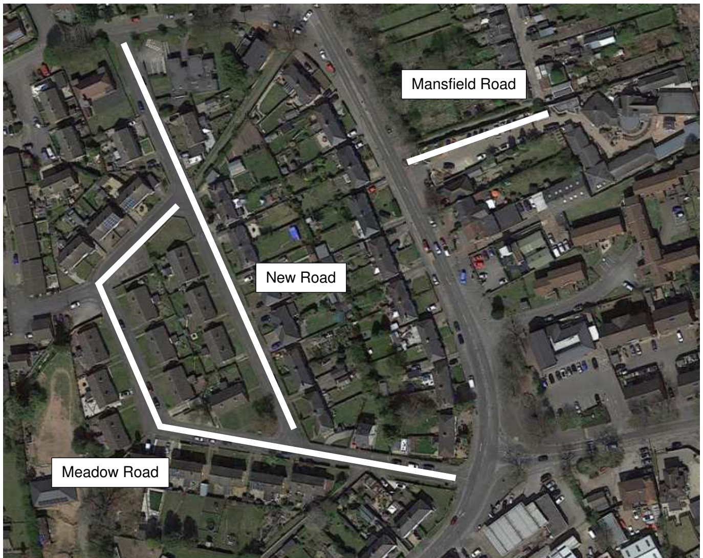
Figure 3. View of Meadow Road, Mansfield Road and New Road.

Areas impacted by flooding on Meadow Road, Mansfield Road and New Road are shown in Figure 3. In total, 2 residential properties were impacted by internal flooding on Meadow Road, 3 properties on Mansfield Road and 1 property on New Road. A surface water flowpath is present which flows through this area from west to east (Figure 4). Due to intense rainfall and resultant overland flow, this flowpath became active with water flowing into properties.