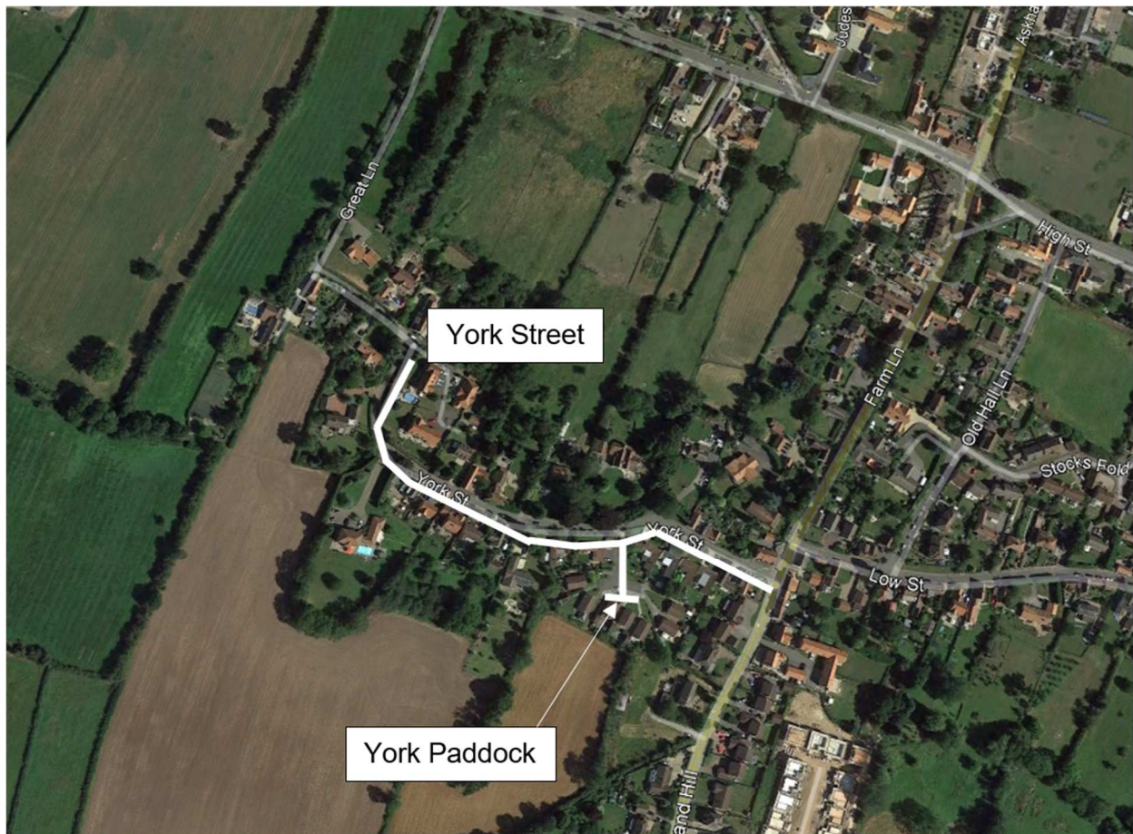
Figure 2. View of East Markham flood affected areas.