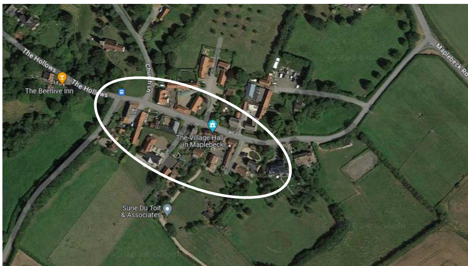
Figure 2. View of Maplebeck highlighting areas affected by internal flooding.