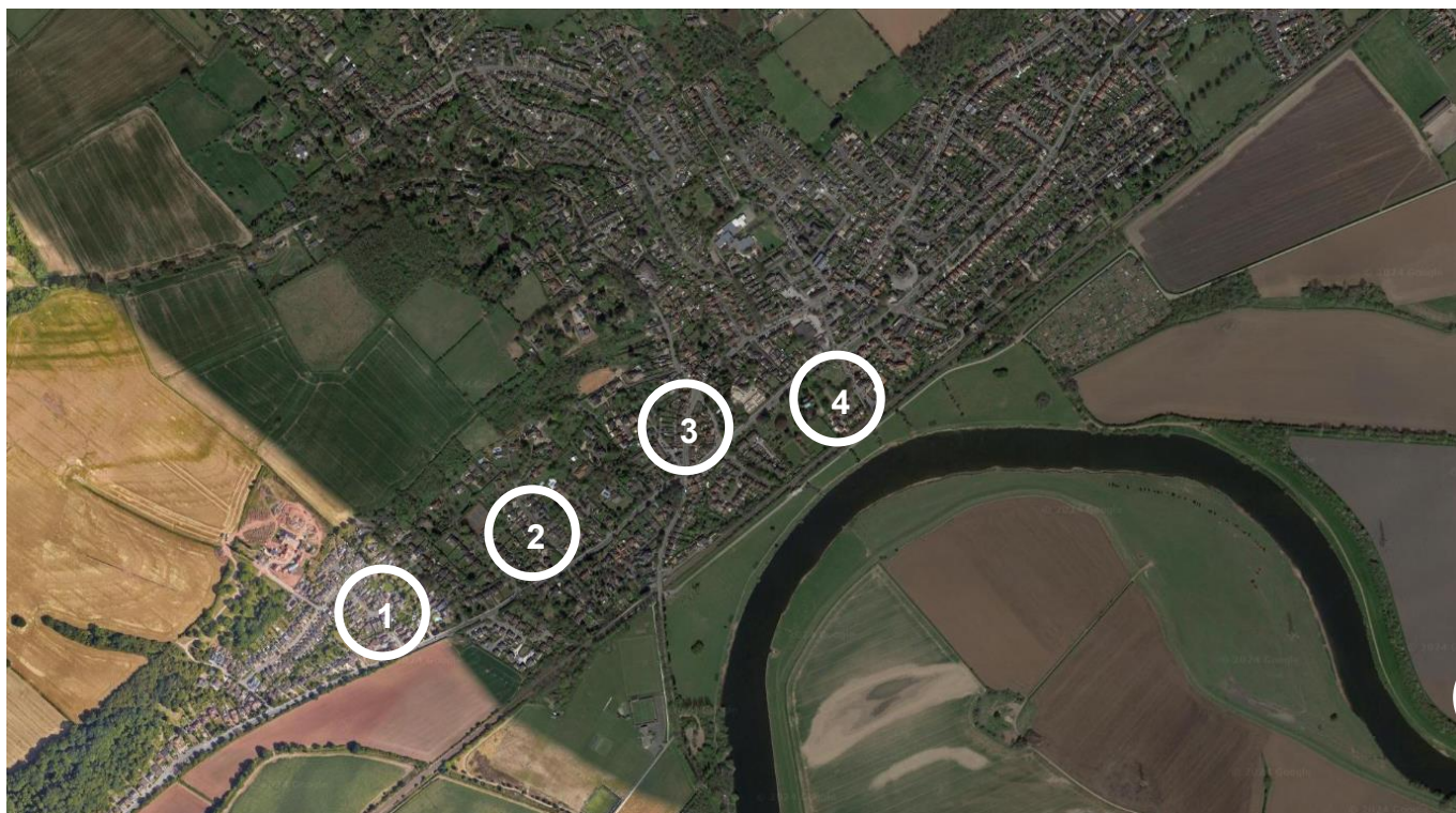
Figure 2. Reference Map for flood affected areas across Burton Joyce. Nottingham Road (1), Cragmoor Road (2), Main Street (3), chestnut Grove (4).