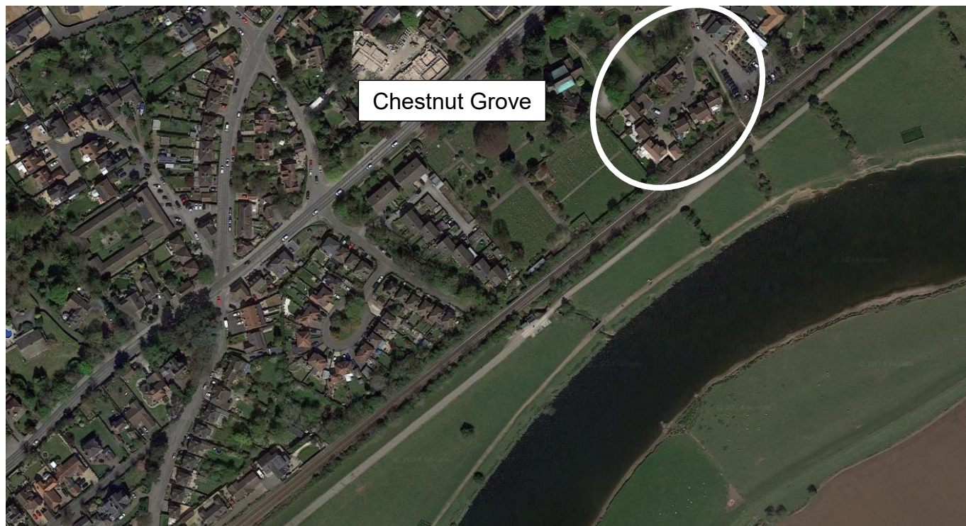
Figure 6. View of Chestnut Grove.