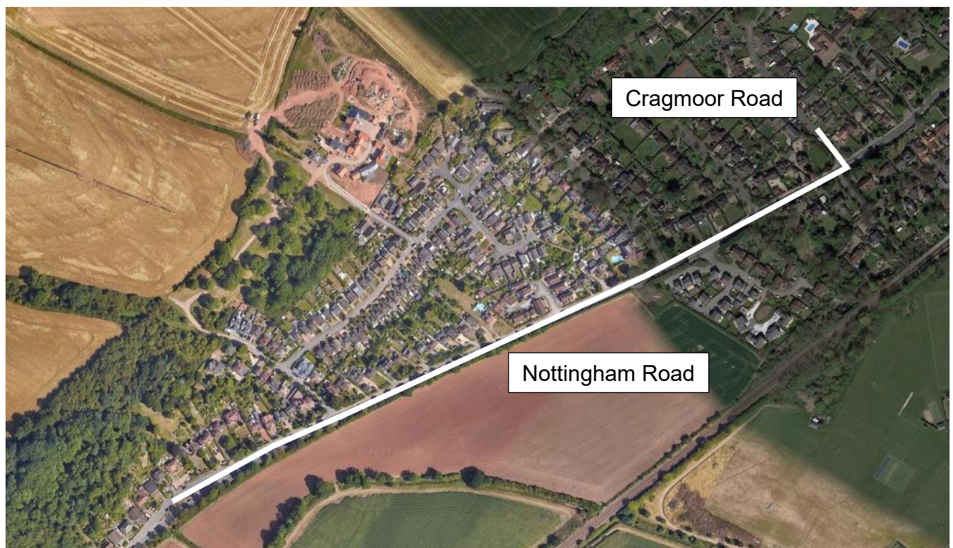
Figure 4. View of Nottingham Road and Cragmoor Road.