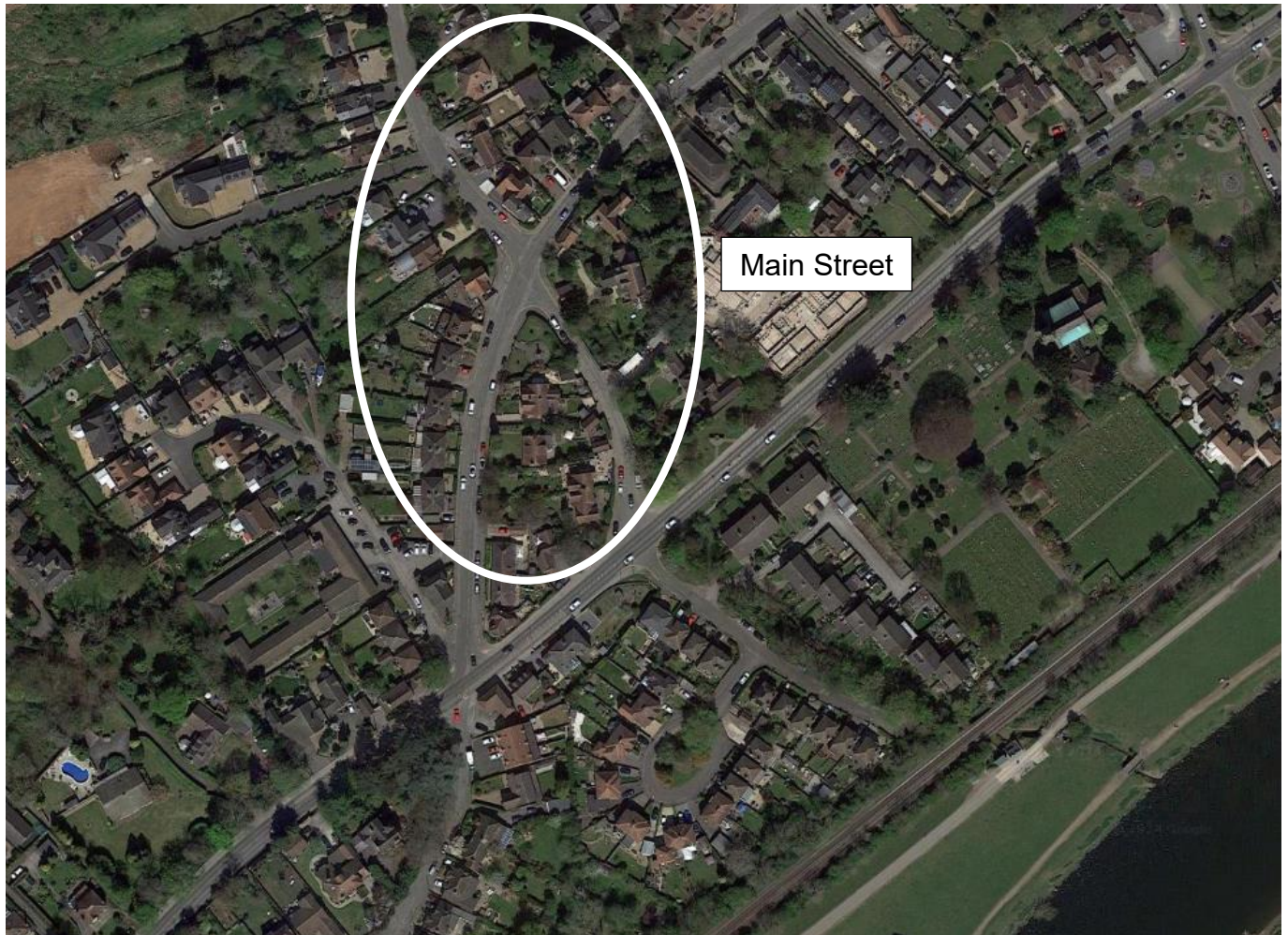
Figure 5. View of Main Street.