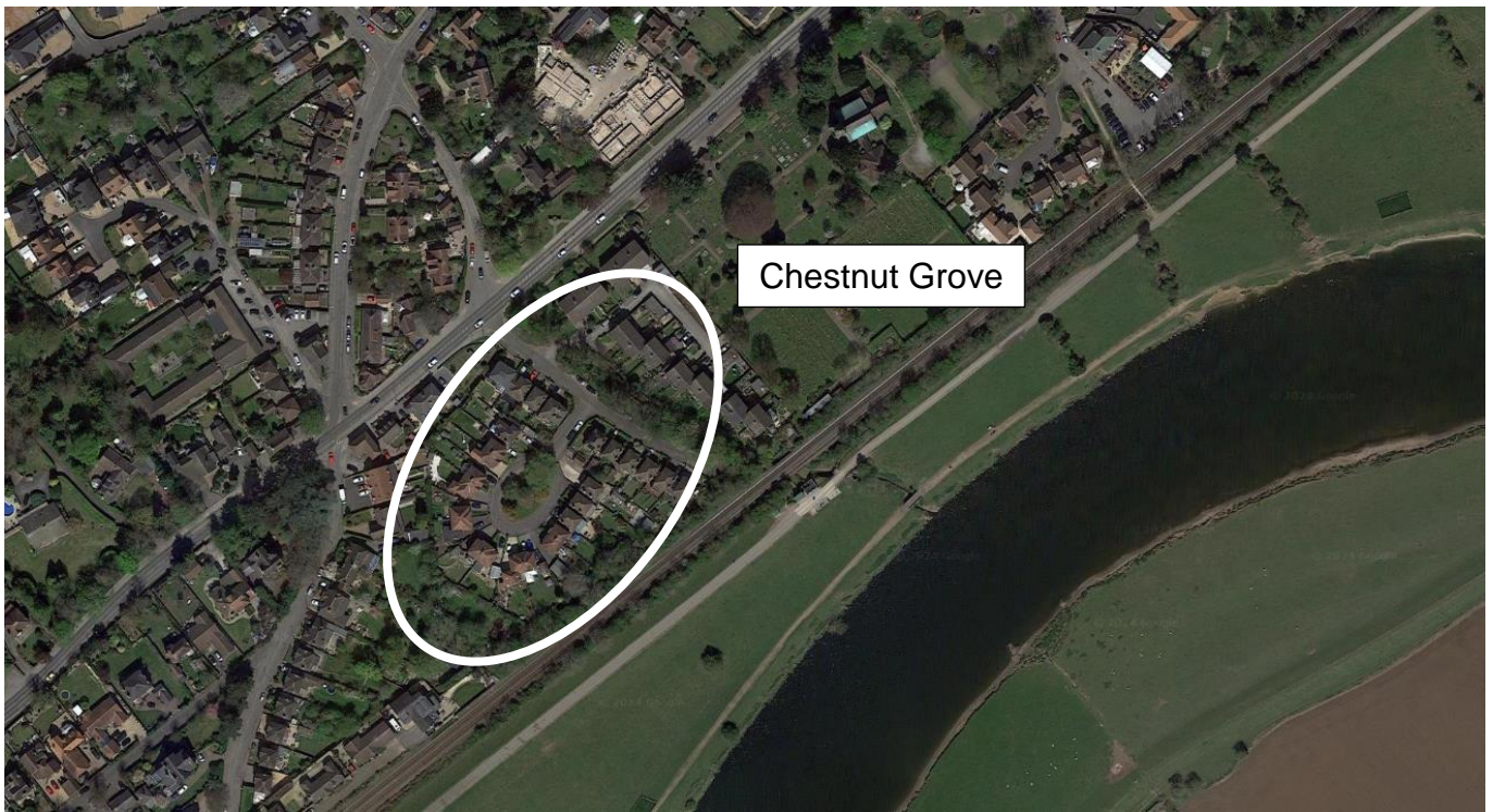
Figure 6. View of Chestnut Grove.