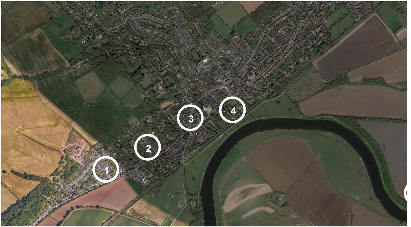
Figure 2. Reference Map for flood affected areas across Burton Joyce. Nottingham Road (1), Cragmoor Road (2), Main Street (3), chestnut Grove (4).