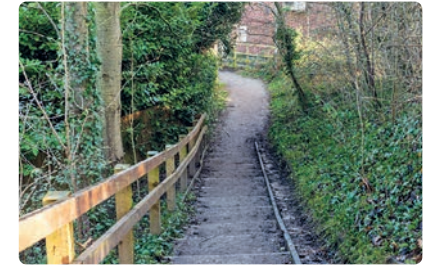
The Green Line