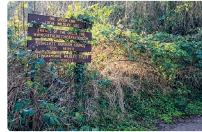
Entrance to the Green Line