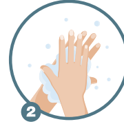
2 Rub back of hands palm