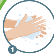
1 Rub front of hands palm