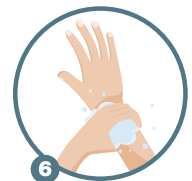
6 Rub wrists