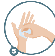
5 Clean fingernails