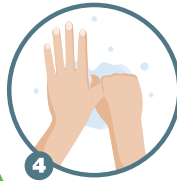
4 Clean fingers