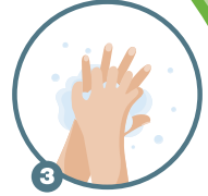
3 Scrub between fingers