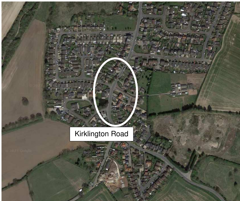
Figure 5. Location Plan – Kirklington Road.

Flooding affected 2 residential properties on Kirklington Road (Figure 5). The area affected on Kirklington Road is a natural low spot. Due to intense rainfall during Storm Babet, the highway drainage capacity was exceeded causing water to pool in the low spot on the road which then flooded into properties.