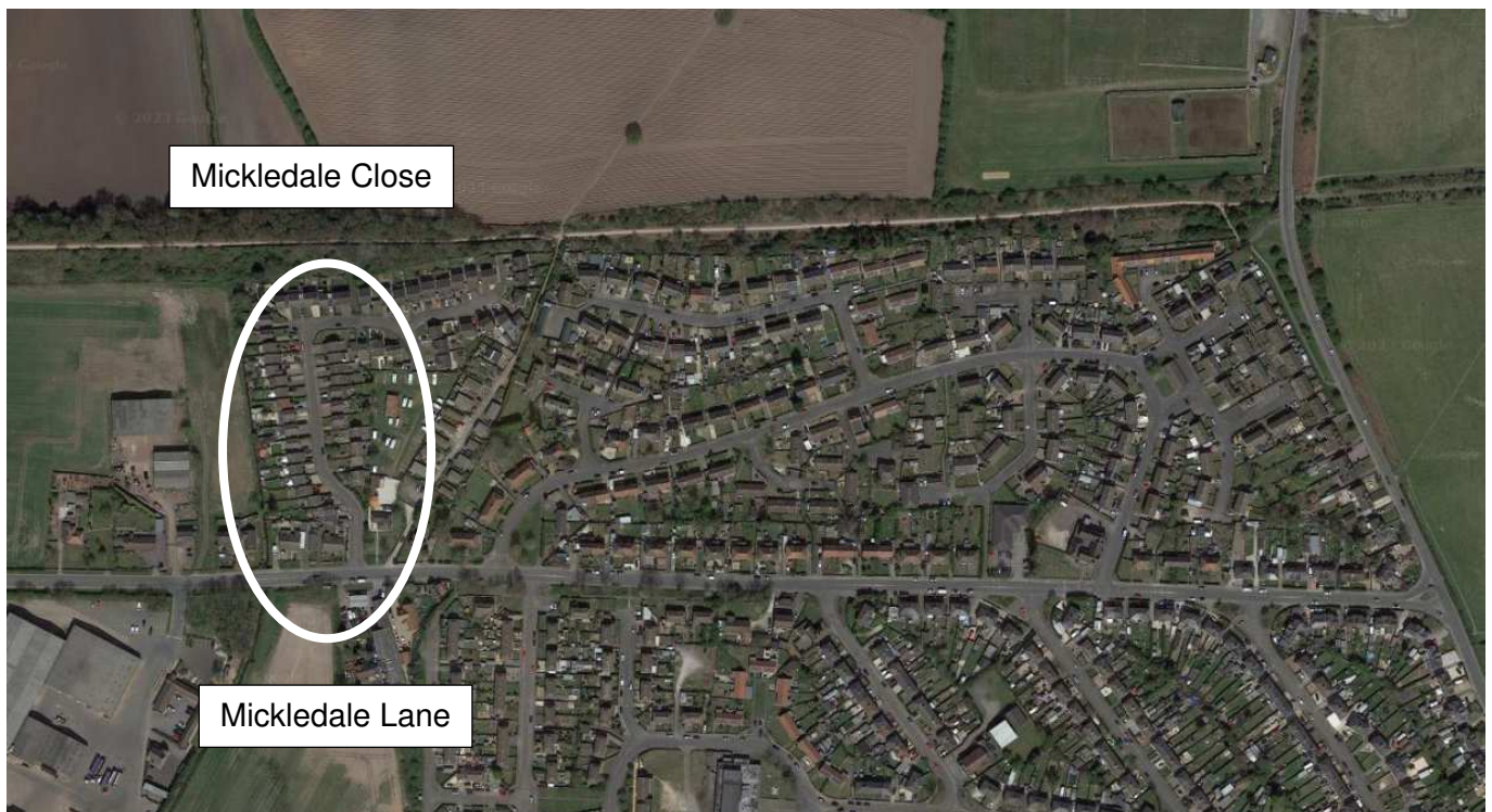
Figure 3. Location Plan – Mickledale Lane and Mickledale Close.

Rainworth Water (ordinary watercourse) flows adjacent to Mickledale Lane on the western side of the road. Although Mickledale Lane and Mickledale Close are not shown to have fluvial flood risk in the Environment Agency Flood Risk Mapping, the area is at risk of surface water flooding as shown in Figure 4. The watercourse (Rainworth Water) has a large catchment at this point and due to heavy rainfall during Storm Babet, high flows were generated causing the watercourse to burst its banks and flow into properties.