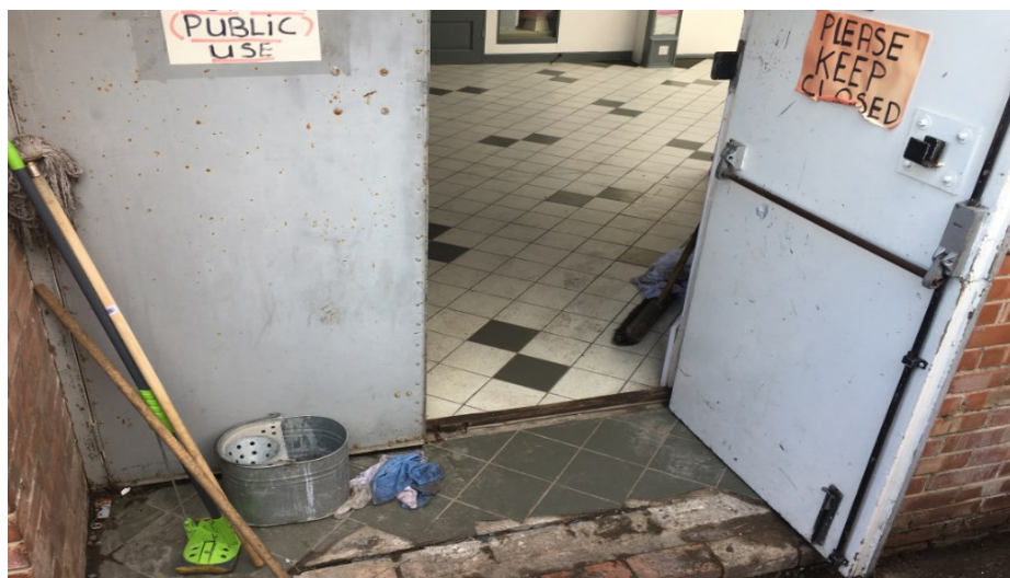
Figure 5. Photo showing rear access to The Forest Centre shopping arcade where flood water entered the building.