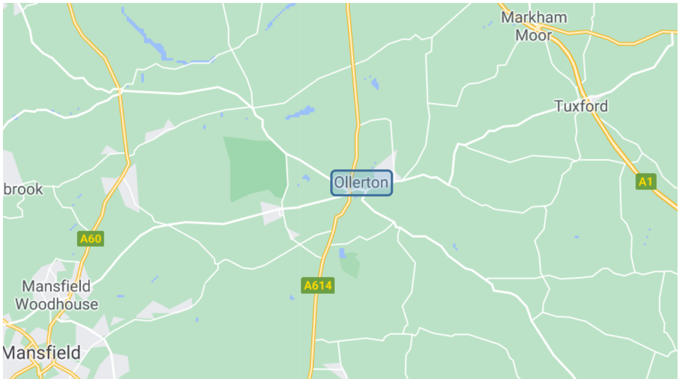
Figure 1. Location Plan.