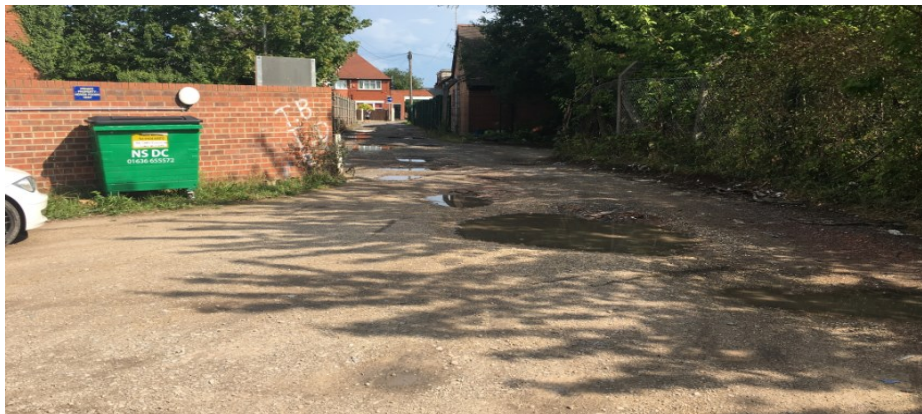
Figure 4. Photo showing carpark and access to rear of affected businesses.