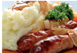
Nottinghamshire sausage, Yorkshire pudding, gravy & mashed potatoes