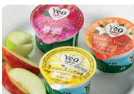
Fruit yoghurt & apple wedge Milk