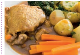
Turkey & vegetable pie roast potatoes & gravy Milk Fish Gluten