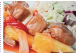
Sweet & sour chicken & wholegrain rice Celery