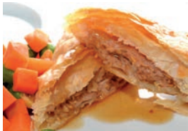
Vegetarian sausage roll, gravy & roast potatoes