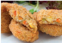
Vegetable nuggets with BBQ dip & baby baked potatoes Gluten