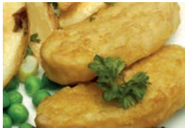
Quorn dippers & savoury rice