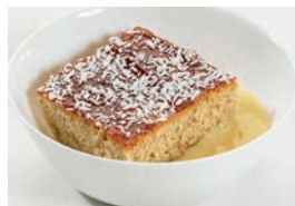
Coconut sponge & custard