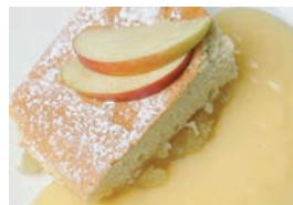
Spiced apple cake & custard