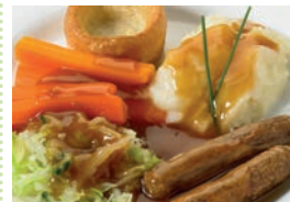
Quorn sausage, gravy & mashed potatoes