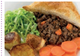
Quorn & vegetable pie, gravy & roast potatoes Egg Gluten