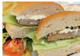
Quorn burger in a bun & carrot fries Soya Milk Egg Gluten