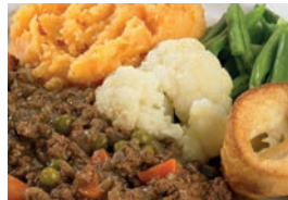
Savoury beef with mashed potatoes & Yorkshire pudding