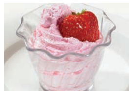
Strawberry mousse & fruit