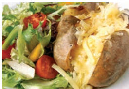
Jacket potatoes with cheese, beans or tuna & mixed salad