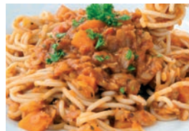
Quorn spaghetti bolognese & garlic slice