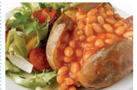
Jacket potatoes with cheese, beans or tuna & mixed salad