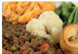
Savoury quorn with mashed potatoes & Yorkshire pudding