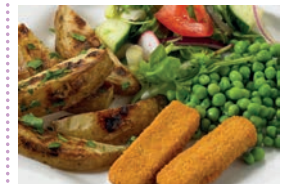
Fishless finger & chips Gluten