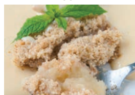
Oaty apple crumble & custard Milk Gluten