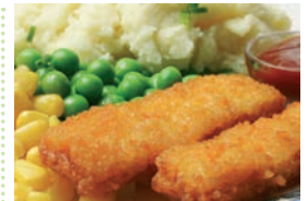
MSC Fish fingers & diced potatoes