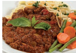
Spaghetti bolognese & garlic slice