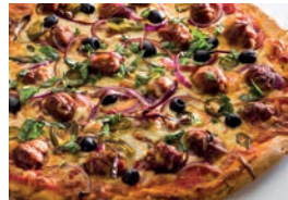
BBQ Chicken pizza & potato wedges