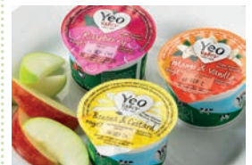
Fruit yoghurt & apple wedge