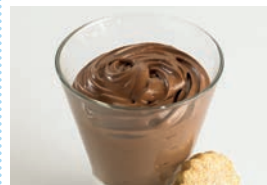
Chocolate mousse & shortbread finger