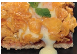
Cornflake tart & custard