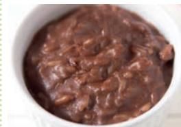
Chocolate rice pudding