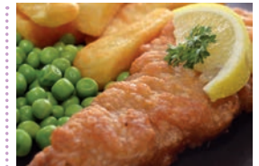
MSC Breaded fish & chips Fish Gluten