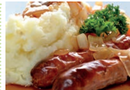
Nottinghamshire sausage, Yorkshire pudding, gravy & mashed potatoes