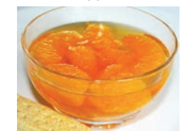
Fruit in jelly & shortbread biscuit