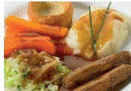
Quorn sausage, gravy & mashed potatoes