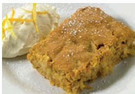
Carrot & pineapple traybake & cream Milk Egg Gluten