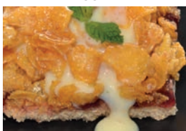
Cornflake tart & custard