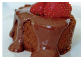
Chocolate ice cream roll & chocolate sauce Soya Milk Egg Gluten