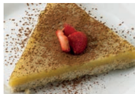
Butterscotch tart Milk Gluten