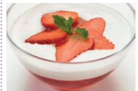
Fruit topped yoghurt & jelly layer Milk

AVAILABLE DAILY: Best of both bread Gluten and Soya Seasonal vegetables available daily Coleslaw Egg when served. Vegetarian meals available on request