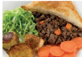
Beef & vegetable pie with mashed potatoes