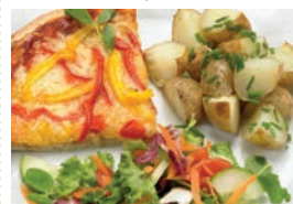
Margherita pizza & jacket wedges