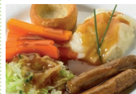
Quorn sausage, gravy & mashed potatoes