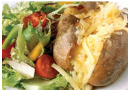
Jacket potatoes with cheese, beans or tuna & mixed salad