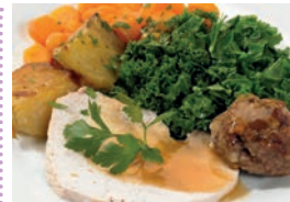
Roast turkey, stuffing & gravy with mashed & roast potatoes Gluten