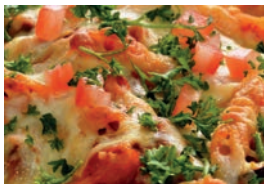
Pasta Neopolitan & garlic slice Soya Milk Gluten Sulphur Dioxide