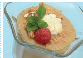
Butterscotch mousse & shortbread finger