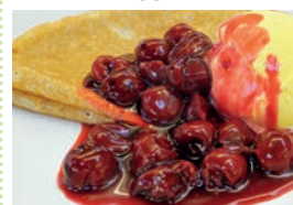
Pancake with frozen yoghurt & hot cherries