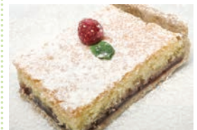
Bakewell tart & custard