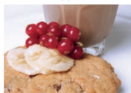
Fruit cookie & hot chocolate