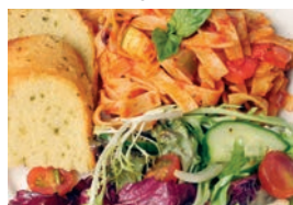
Mediterranean tagliatelle & garlic slice