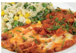
Mixed bean bake & garlic slice