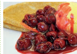
Pancake with frozen yoghurt & hot cherries