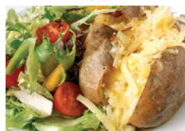
Jacket potatoes with cheese, beans or tuna & mixed salad