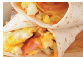
Vegetarian all day breakfast wrap & diced potatoes Celery Milk Egg Gluten