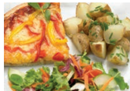
Margherita pizza & jacket wedges