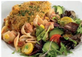
Tuna & sweetcorn pasta & garlic bread