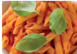
Tomato & basil pasta with garlic slice