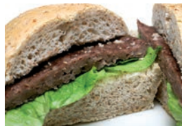
Venison burger in a wholemeal bun & carrot fries