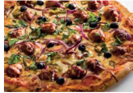
BBQ Chicken pizza & potato wedges