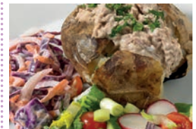
Jacket potatoes with cheese, beans or tuna & mixed salad