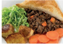
Beef & vegetable pie with mashed potatoes