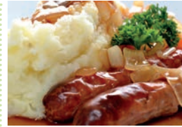
Nottinghamshire sausage, Yorkshire pudding, gravy & mashed potatoes