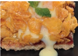
Cornflake tart & custard