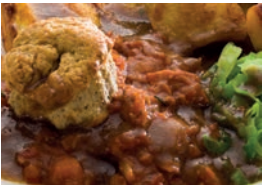
Vegetable cobbler, roast potatoes & gravy