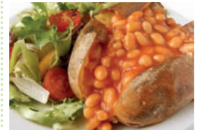
Jacket potatoes with cheese, beans or tuna & mixed salad