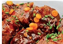
Porkies in gravy, Yorkshire pudding & mashed potatoes