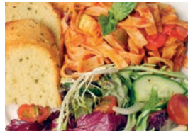
Mediterranean tagliatelle & garlic slice