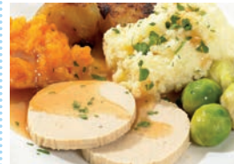
Roast Quorn, Yorkshire pudding & gravy with mashed & roast potatoes