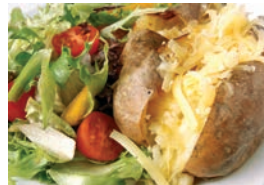
Jacket potatoes with cheese, beans or tuna & mixed salad