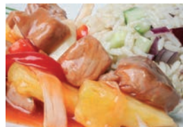
Sweet & sour chicken & wholegrain rice