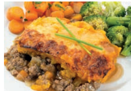
Beef cottage pie, roast potatoes & gravy