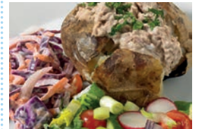
Jacket potatoes with cheese, beans or tuna & mixed salad