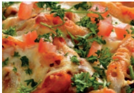
Pasta Neapolitan & garlic slice