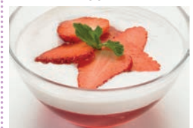
Fruit topped yoghurt & jelly layer