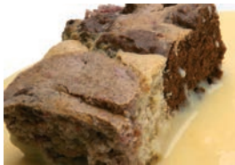
Marble sponge & custard