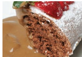
Magic chocolate pudding & chocolate sauce