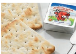
Cheese, crackers & apple wedge