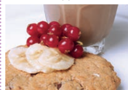
Honey & oatmeal cookie with milkshake