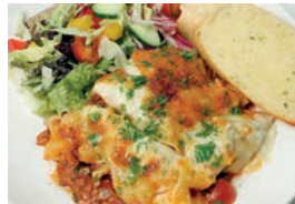
Beef lasagne & garlic slice