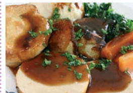
Quorn roast, stuffing & gravy with mashed & roast potatoes