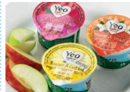
Fruit yoghurt & apple wedge