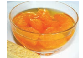
Fruit in jelly & shortbread biscuit