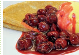
Pancake with frozen yoghurt & hot cherries