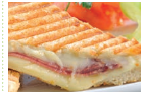
Panini & salad, assorted fillings