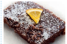
Pear & chocolate sponge & chocolate sauce