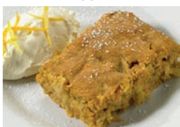
Carrot & pineapple traybake & cream