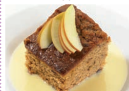
Icky sticky pudding & custard