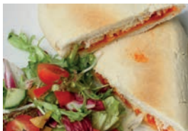
Panini & salad, assorted fillings