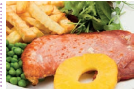
Roast gammon & pineapple with chips