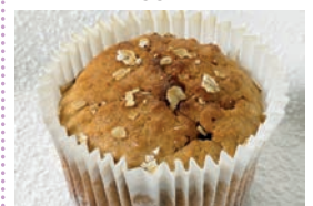
Apple & cinnamon muffin