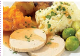
Quorn roast, stuffing & gravy with mashed & roast potatoes