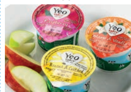
Fruit yoghurt & apple wedge