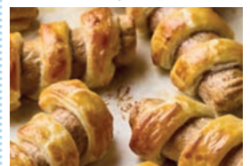
Quorn sausage twist & jacket wedges