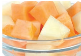
Melon & apple