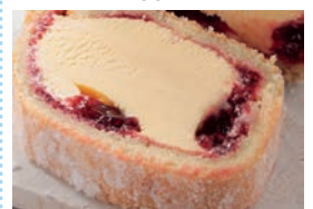
Raspberry ripple ice cream roll