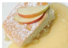
Spiced apple cake & custard