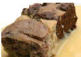
Marble sponge & custard