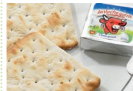
Cheese, crackers & apple wedge