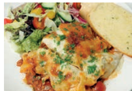
Beef lasagne & garlic slice Mustard Soya Milk Fish Gluten