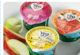
Fruit yoghurt & apple wedge