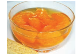
Fruit in jelly & shortbread biscuit