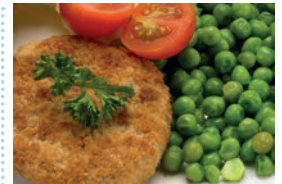
Salmon & sweet potato fishcake & jacket wedges