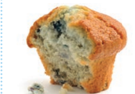
Fruits of the forest muffin