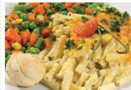
Macaroni vegetable cheese & garlic bread