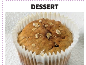
Apple & cinnamon muffin Egg Gluten

AVAILABLE DAILY: Best of both bread Gluten and Soya Seasonal vegetables available daily Coleslaw Egg when served. Vegetarian meals available upon request