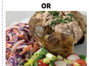
Jacket potatoes with cheese, beans or tuna & mixed salad Milk Egg Fish