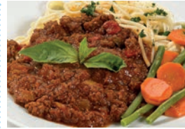
Spaghetti bolognese & garlic slice