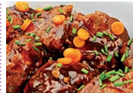
Porkies in gravy, Yorkshire pudding & mashed potatoes Soya Milk Egg Gluten