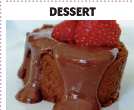
Chocolate ice cream roll & chocolate sauce Soya Milk Egg Gluten