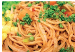
Sweet & sticky turkey noodles