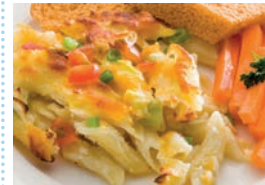
Cheesy tomato pasta & garlic slice