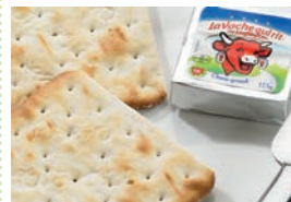
Cheese, crackers & apple wedge