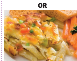
Cheesey leek pasta & garlic slice Mustard Soya Milk Gluten