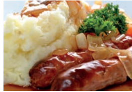
Nottinghamshire sausage, Yorkshire pudding, gravy & mashed potatoes