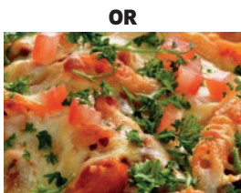
Pasta Neopolitan & garlic slice Soya Milk Gluten Sulphur Dioxide