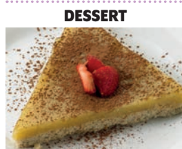
Butterscotch tart Milk Gluten