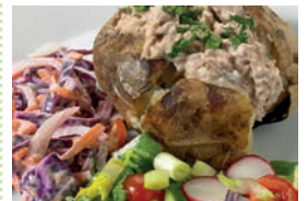
Jacket potatoes with cheese, beans or tuna & mixed salad