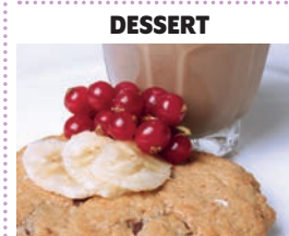
Honey & oatmeal cookie with milkshake Milk Gluten