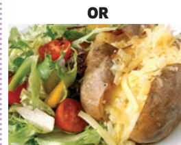
Jacket potatoes with cheese, beans or tuna mixed salad Milk Egg Fish