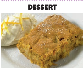
Carrot & pineapple traybake & cream Milk Egg Gluten