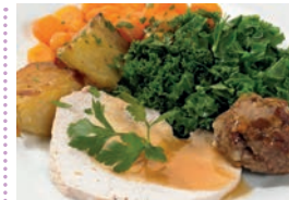
Roast turkey, stuffing & gravy with mashed & roast potatoes Gluten