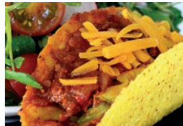
Beef Tacos & potato wedges