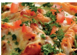
Pasta Neopolitan & garlic slice