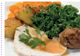
Roast turkey, stuffing & gravy with mashed & roast potatoes