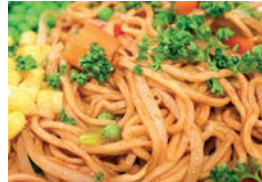
Sweet & sticky turkey noodles