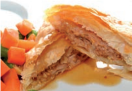
Vegetarian sausage roll, gravy & roast potatoes