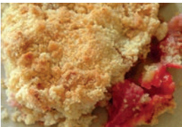
Apple & plum crumble & custard