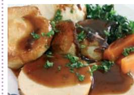
Quorn roast, stuffing & gravy with mashed & roast potatoes