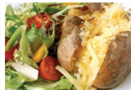
Jacket potatoes with cheese, beans or tuna & mixed salad