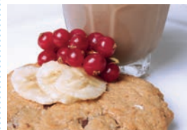
Fruit cookie & hot chocolate