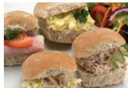
Filled roll with cheese, ham, egg or tuna & mixed salad