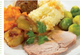
Roast pork, stuffing, gravy, mashed potatoes & Yorkshire pudding