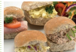
Filled roll with cheese, ham, egg or tuna & mixed salad