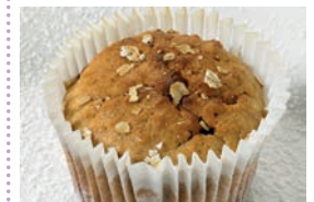
Apple & cinnamon muffin Egg Gluten

AVAILABLE DAILY: Best of both bread Gluten and Soya Seasonal vegetables available daily Coleslaw Egg when served. Vegetarian meals available upon request