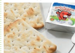
Cheese, crackers & apple wedge