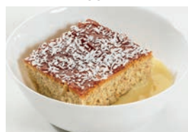
Coconut sponge & custard