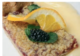
Crispy jam tart & custard