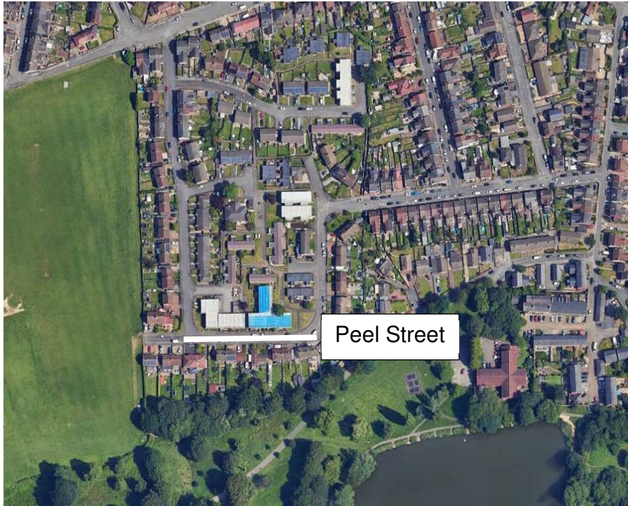
Figure 4: Affected roads: Peel Street.