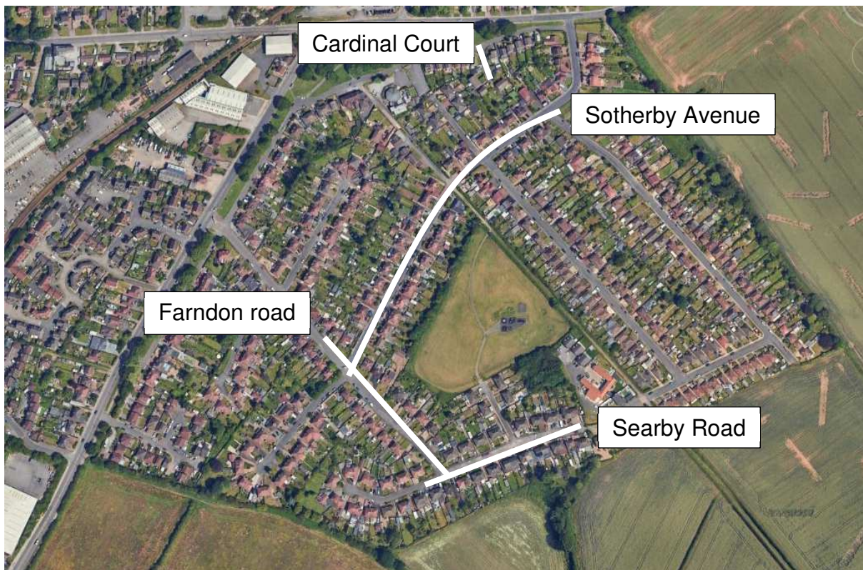
Figure 3: Affected roads: Searby Road, Sotherby Avenue, Farndon Road & Cardinal Court.