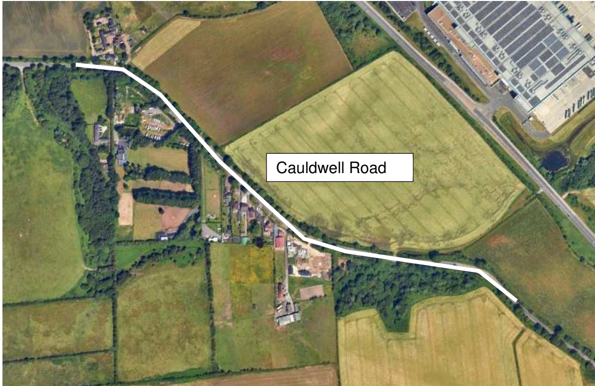
Figure 6: Affected roads: Cauldwell Road