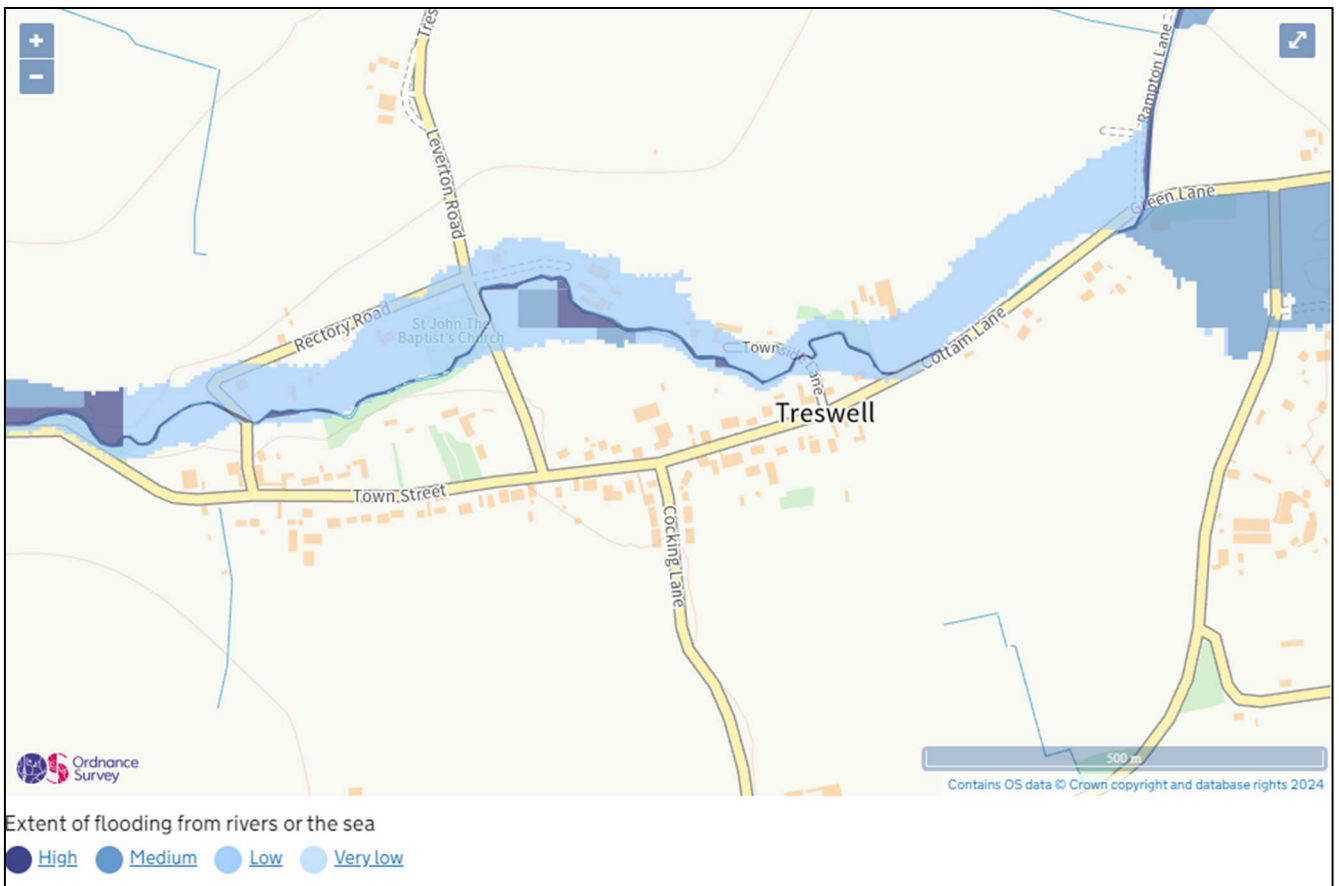
Figure 3. Fluvial Flood Risk Mapping. Data Provided by the Environment Agency.