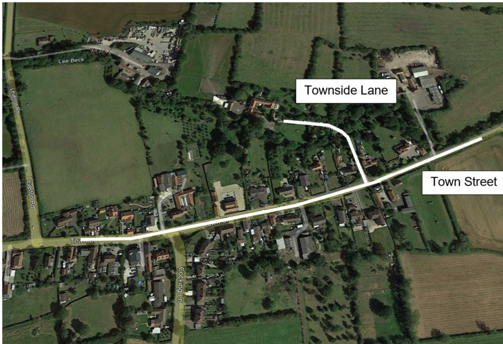
Figure 2. View of Treswell flood affected areas.