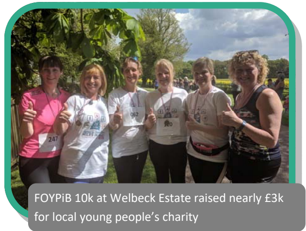
FOYPiB 10k at Welbeck Estate raised nearly £3k for local young people’s charity

The network has published an inventory of children’s and young people’s wellbeing services in Bassetlaw, and a ‘choose well for young people in Bassetlaw’ poster. These are available at: www.betterinbassetlaw.co.uk/wellbeing-in-bassetlaw/children-and-young-people/ .