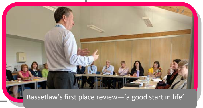
Bassetlaw’s first place review—‘a good start in life’

provides trauma informed resilience work with children), looked after children’s nurse, primary care networks and CAMHS provided insights about the differences they are making for children in Bassetlaw.