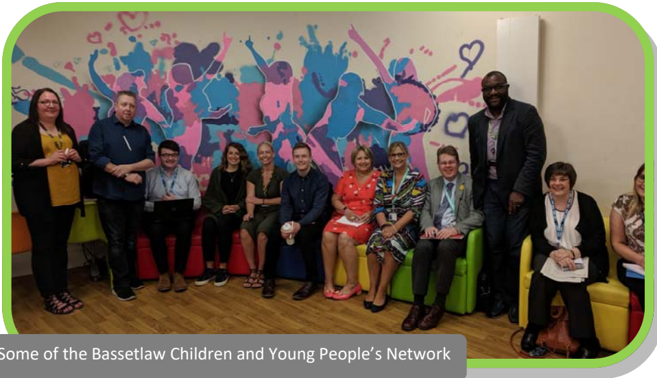
Some of the Bassetlaw Children and Young People’s Network

The network also focuses on priority issues for local young people, having recently connected support for young carers, and now developing wider understanding and approaches to ‘county lines’ drug issues through contextualised safeguarding approaches.