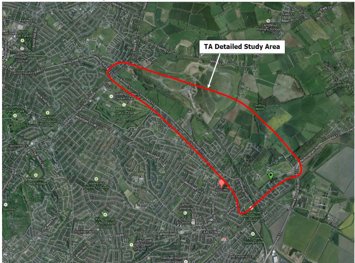
Figure 2: Transport Assessment Study Area