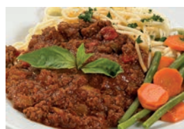
Spaghetti Bolognese, crusty bread