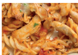
Chicken pasta bake, garlic slice