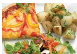
Margherita pizza, jacket wedges