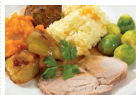
Roast pork, stuffing, gravy, roast & mashed potatoes