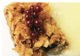
Cornflake tart & custard