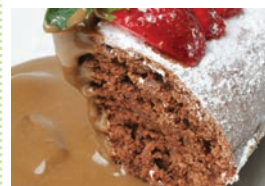
Magic chocolate pudding & chocolate sauce