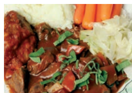
Beef casserole & herby dumplings, gravy, mashed potatoes