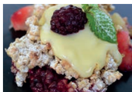
Apple & blackberry crumble & custard