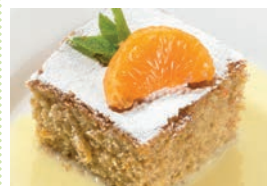
Spiced carrot cake & custard