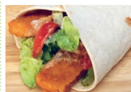
MSC fish finger wrap, noisette potatoes