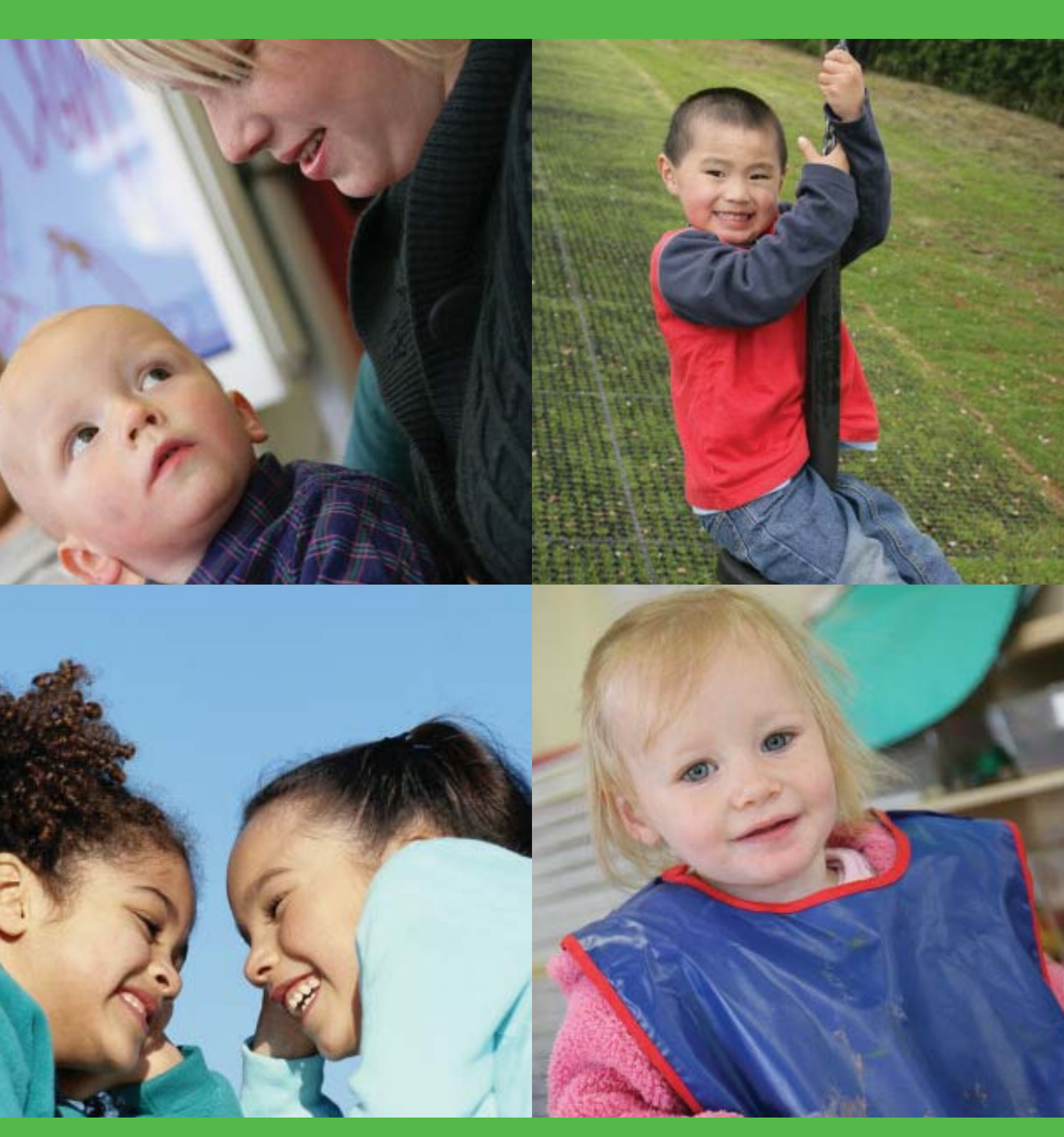
Developed by the Tackling Child Poverty Reference Group