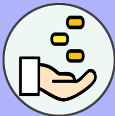
£1.1bn NHS cash savings