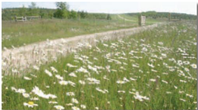
Ollerton Pit Wood

The Green Estate comprises 97 sites spread predominantly across the western half of the county. Many of the sites are former colliery tips, or mineral lines that have been restored to informal green space. A full list and individual site maps/plans can be found in Appendix 1.