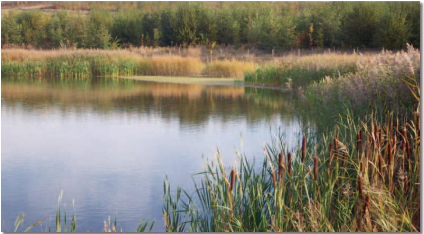
Heron Lake, Cotgrave Country Park