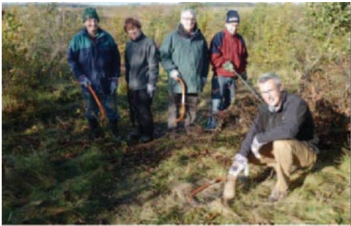
Friends of The Woodlands, Shireoaks

Enabling volunteer working, directly and through friends groups, will continue to be key aspect of our work on the Green Estate. It engages communities, develops a sense of community ownership and facilitates many aspects of site maintenance.