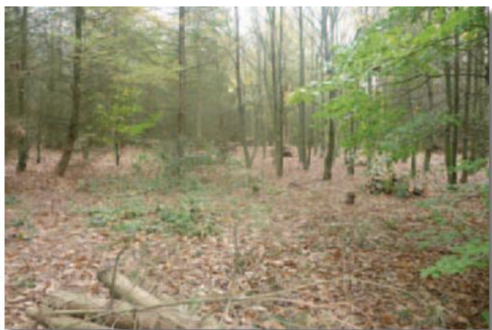
Woodland thinned by the Friends of Tippings Wood in October 2011

The Friends meet at least once a week throughout the year. During the summer months they regularly cut back vegetation to keep the network of paths open for public use. During the winter months, conservation works are more typical, for example hedge laying and woodland thinning. During the last year these activities totalled almost 600 hours of time spent on site.