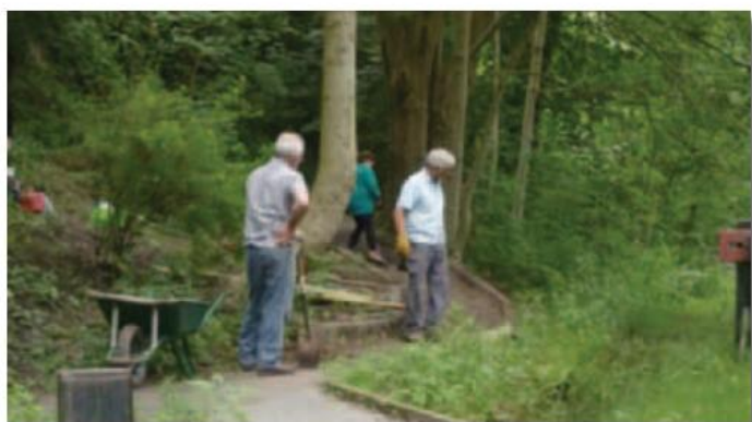
Volunteers at Kimberley Nature Area

Volunteering on the Green Estate provides a fantastic opportunity for people to acquire knowledge about their local environment, and develop or learn new skills.