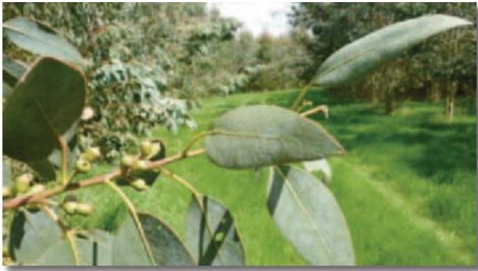
Daneshill Energy Forest

We will review all of the income generation opportunities within the Green Estate including the potential for coal recovery on some of the older restoration schemes where this is deemed appropriate and cost effective.