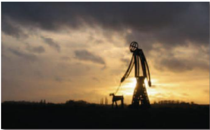
The Stick Man, Linby Ranges

The Green Estate team will encourage local community and other organisations to use their local green spaces for events and activities. We will develop a quick and easy approval process to ensure that community groups have the appropriate level of approval and support with minimum bureaucracy.