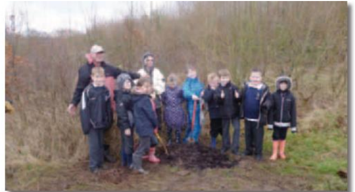
School group and new nature trail

The group is comprised of representatives of various interest and user groups and the meetings provide a lively forum for debate and discussion as to how the park should be managed. The meetings bring together these groups and representatives from the town and district councils and this enables problems and conflicts between users to be aired and resolved.