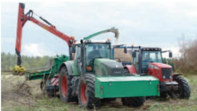
Harvesting Eucalyptus at Daneshill Energy Forest

We aim to further develop and manage our estate to maximise income to ensure that the Green Estate is sustainable for the long term.