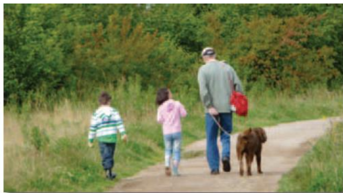
Cotgrave Country Park

The county council produced 'Our Strategy for Health and Wellbeing in Nottinghamshire 2012-2013 in which section 8.3 makes reference to healthy environments in which to live, work and play. Access to open green space and play areas all impact upon physical and mental wellbeing.