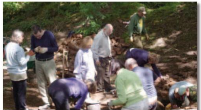
Volunteers working at a Moor Pond Wood archaeological event

The group has successfully secured external grant aid through the Landfill Tax Credit Scheme, and this has led to the development and implementation of the site's archaeological conservation plan. Working with Green Estate team and the county archaeologist, research into the industrial archaeology of the site, has resulted in archaeological digs and the construction of a scale topographical model showing the watercourses and infrastructure of this important site.