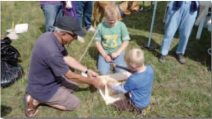
Bird Box Making at Cotgrave

A vibrant friends group has been established and works closely with the Green Estate team to manage and develop the site. The Friends meet regularly to discuss site issues with the Green Estate site officer, and to discuss and develop ideas relating to the management of the park.