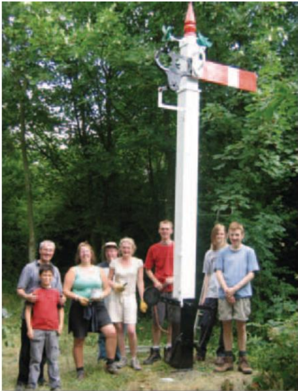
Volunteers with a restored signal on the Great Northern Railway Path

We actively seek to manage our landholding in a sustainable manner, using, for example, recycled materials and colliery waste to surface our network of trails, and to further develop our agricultural estate for biomass production.