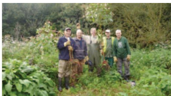
Volunteers pulling invasive Himalayan Balsam Removal along the River Leen

Local, well managed informal green spaces significantly contribute to the quality of life for local communities. We encourage community participation in developing and engaging friends groups for our more popular Green Estate sites.