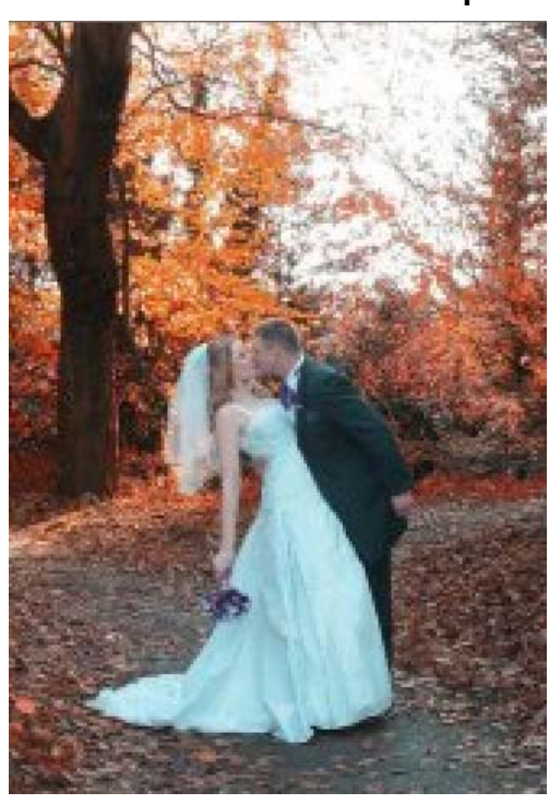
Civil Marriages and Civil Partnerships