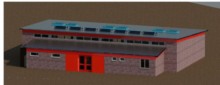
7 Artistic Impression