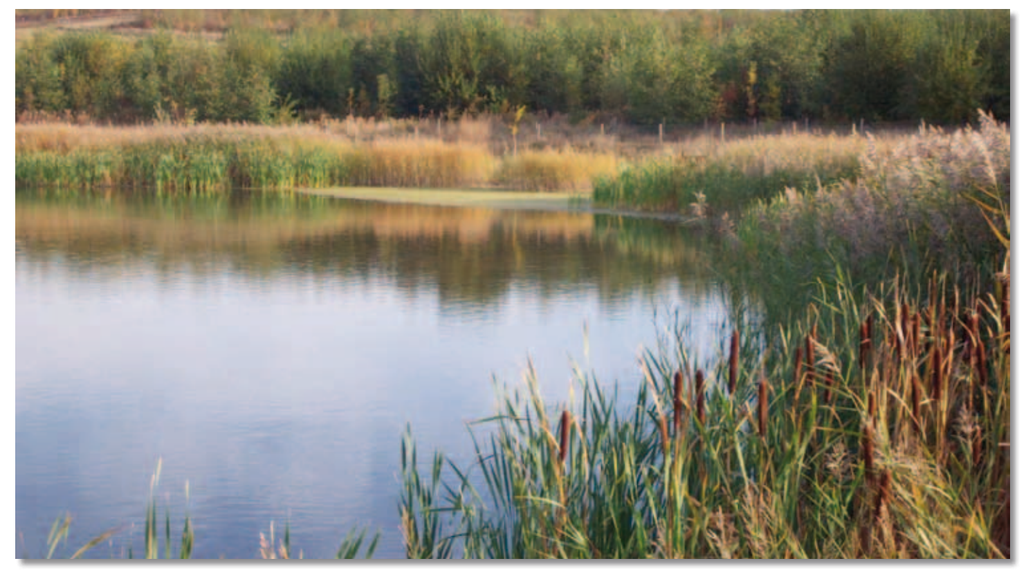
Heron Lake, Cotgrave Country Park