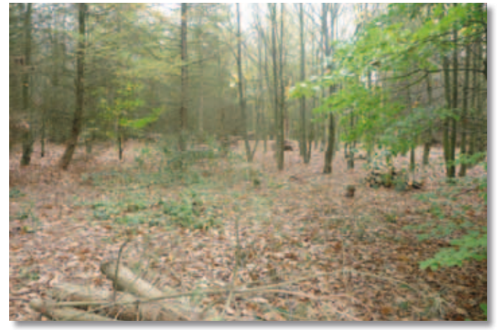
Woodland thinned by the Friends of Tippings Wood in October 2011

The Friends meet at least once a week throughout the year. During the summer months they regularly cut back vegetation to keep the network of paths open for public use. During the winter months, conservation works are more typical, for example hedge laying and woodland thinning. During the last year these activities totalled almost 600 hours of time spent on site.