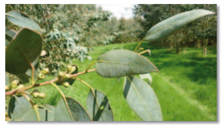
Daneshill Energy Forest

We will review all of the income generation opportunities within the Green Estate including the potential for coal recovery on some of the older restoration schemes where this is deemed appropriate and cost effective.