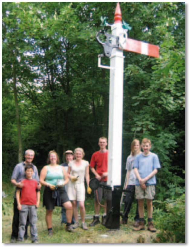
Volunteers with a restored signal on the Great Northern Railway Path

We actively seek to manage our landholding in a sustainable manner, using, for example, recycled materials and colliery waste to surface our network of trails, and to further develop our agricultural estate for biomass production.