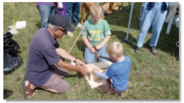
Bird Box Making at Cotgrave

A vibrant friends group has been established and works closely with the Green Estate team to manage and develop the site. The Friends meet regularly to discuss site issues with the Green Estate site officer, and to discuss and develop ideas relating to the management of the park.