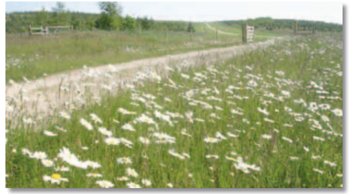
Ollerton Pit Wood

The Green Estate comprises 97 sites spread predominantly across the western half of the county. Many of the sites are former colliery tips, or mineral lines that have been restored to informal green space. A full list and individual site maps/plans can be found in Appendix 1.