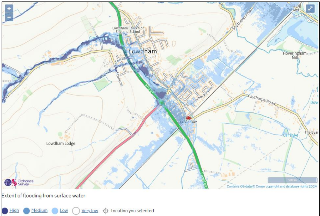
Figure 3. Predicted Surface Water Flood Extents