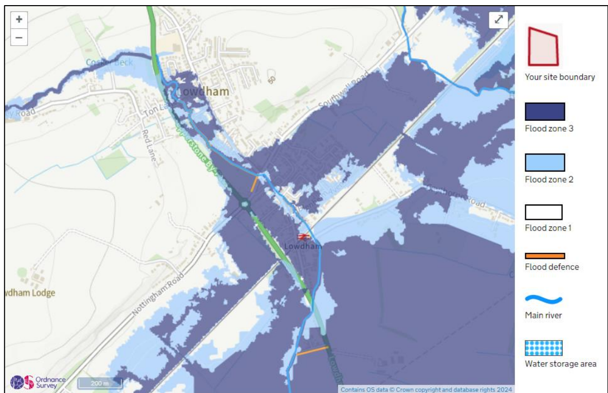
Figure 2. Predicted Flood Zone Extents (FZ3 is darkest area)