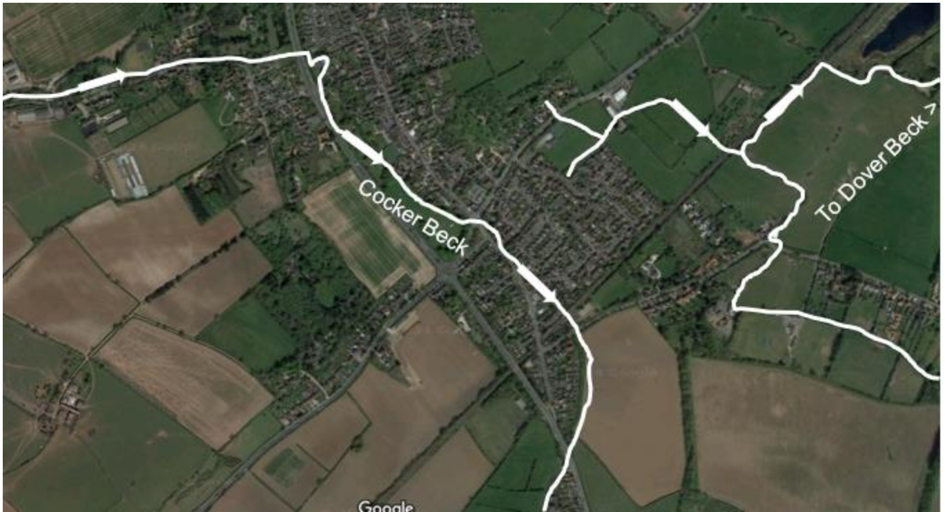
Figure 1. View of Lowdham showing approximate routes of The Cocker Beck and other watercourses through the village (watercourses shown as white lines with arrows showing direction of flow).