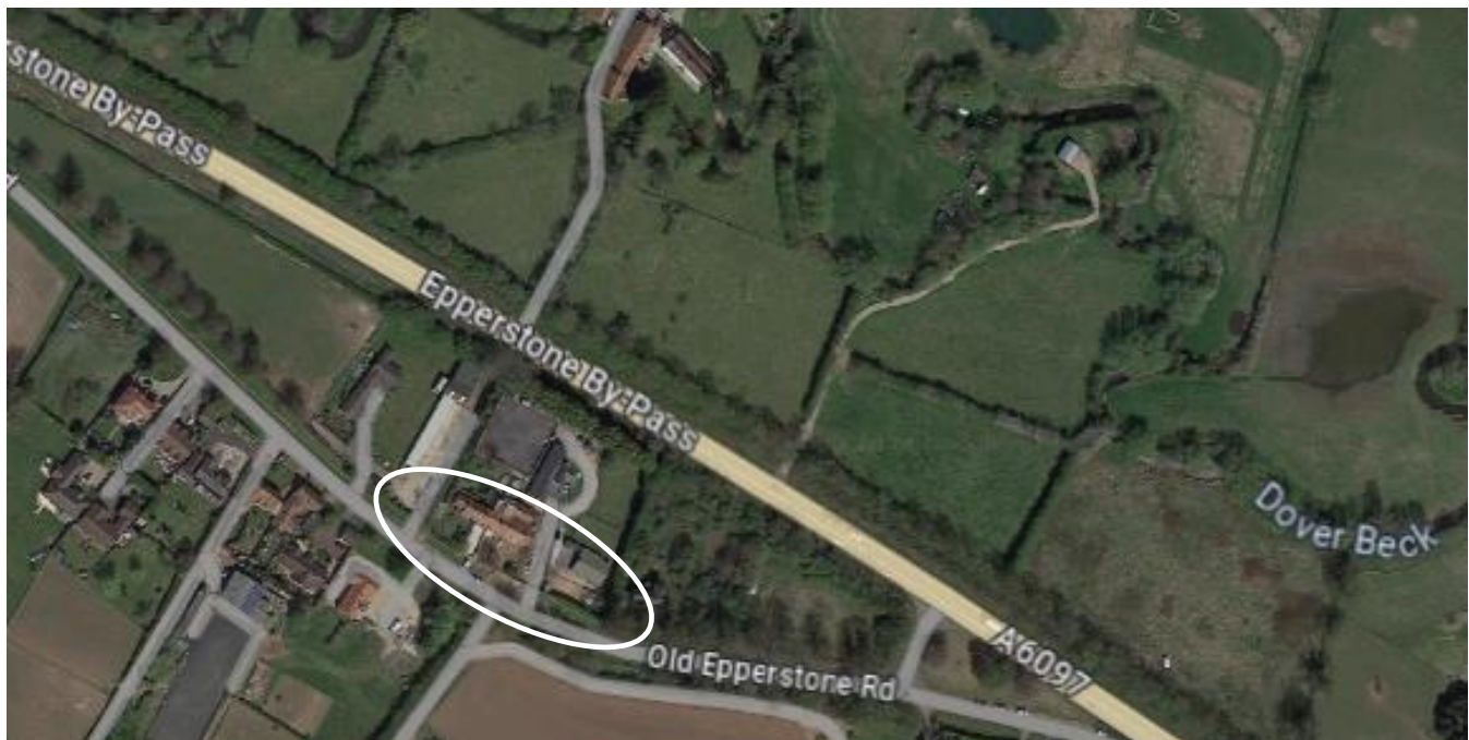
Figure 6. View of Lowdham highlighting areas of isolated internal flooding.