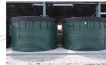
Typical example of a 150,000ltr water tank (colour to be confirmed) Dimensions: 9.1m (Dia.) x 2.28m (H)