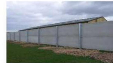
Typical example of a steel column & concrete panel wall Details to be agreed