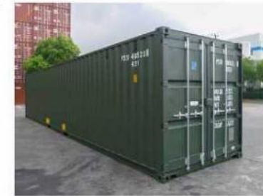
Typical 40ft shipping container (non permanent structure) Colour to be confirmed