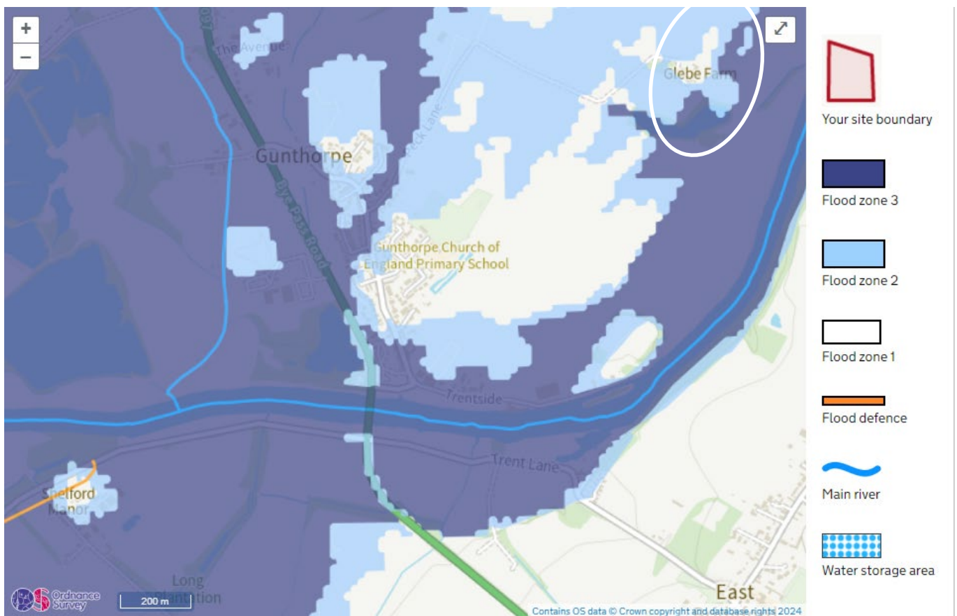
Figure 5. Excerpt from the Flood map for Planning