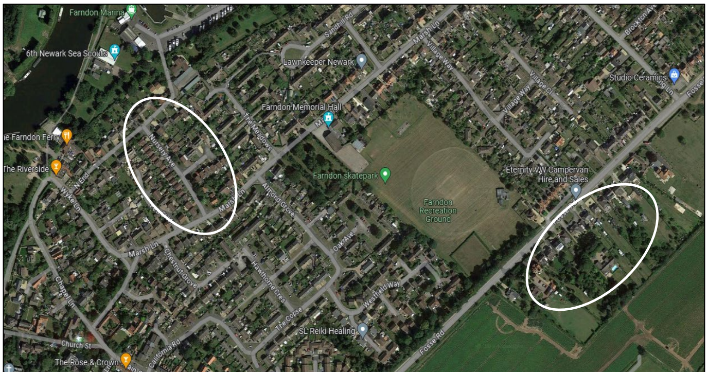
Figure 5. View of Farndon highlighting areas affected by internal flooding.

10. Figure 5 shows the areas affected by internal flooding.