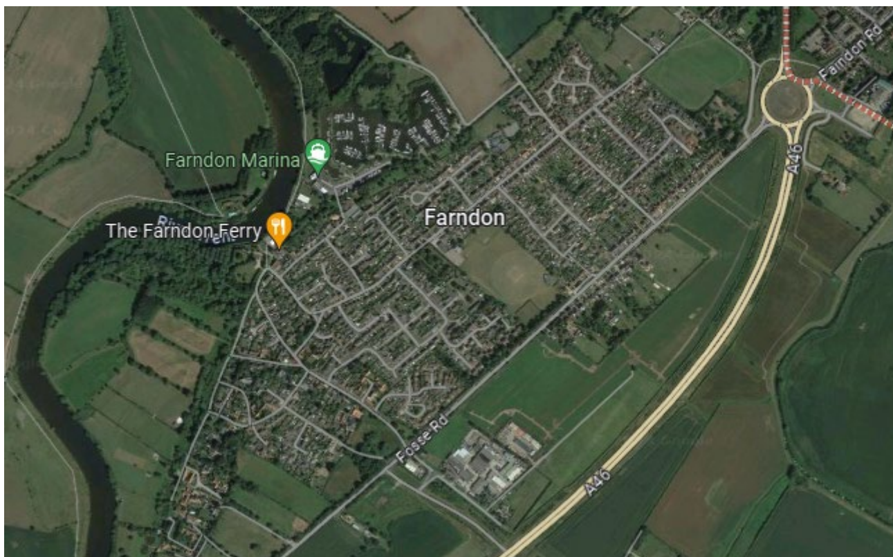
Figure 1 Farndon location map.