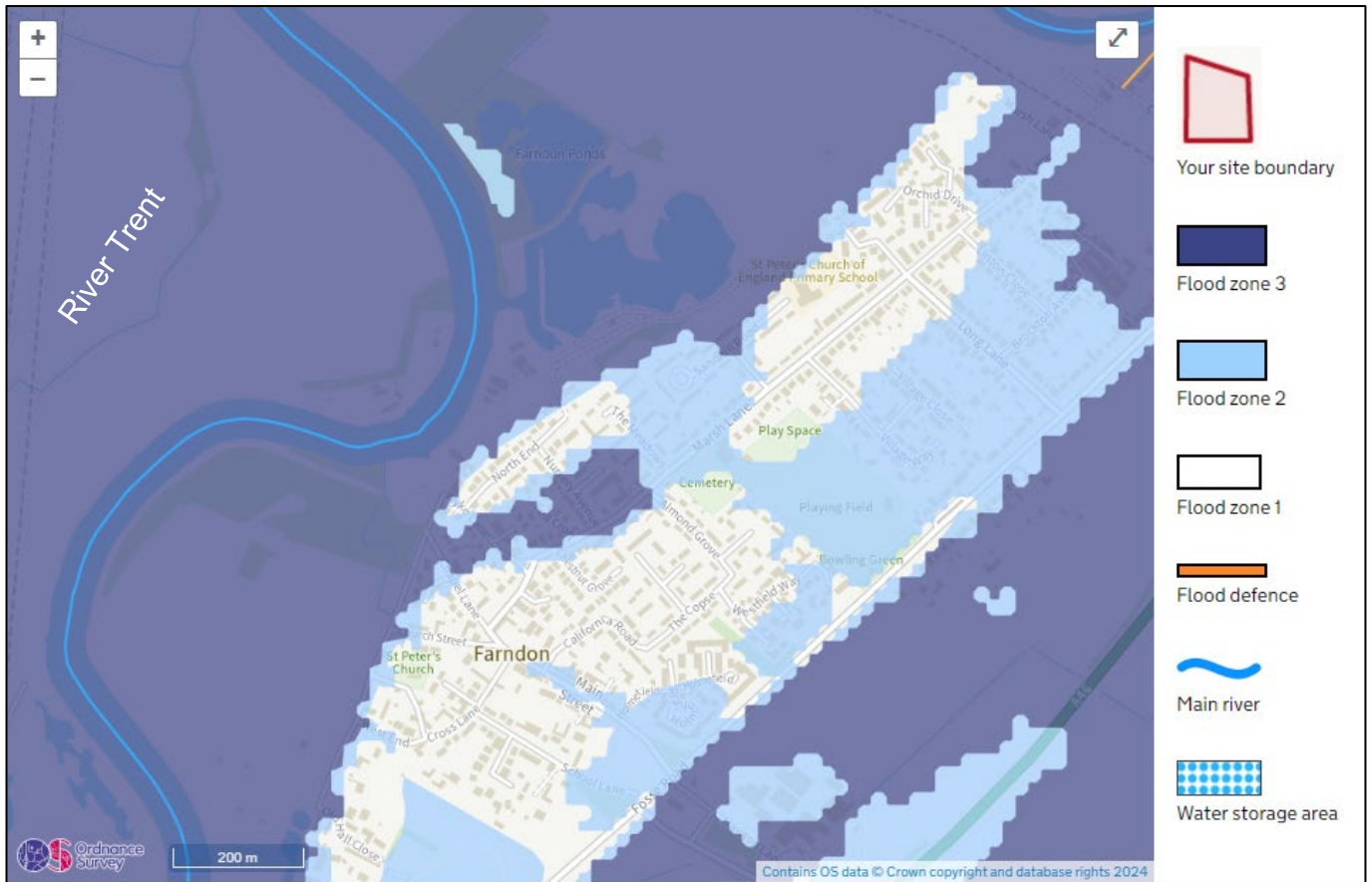
Figure 3. Predicted Flood Zone Extents (FZ3 is darkest area)