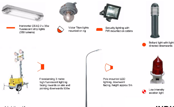
Lighting Key Scale N.T.S.