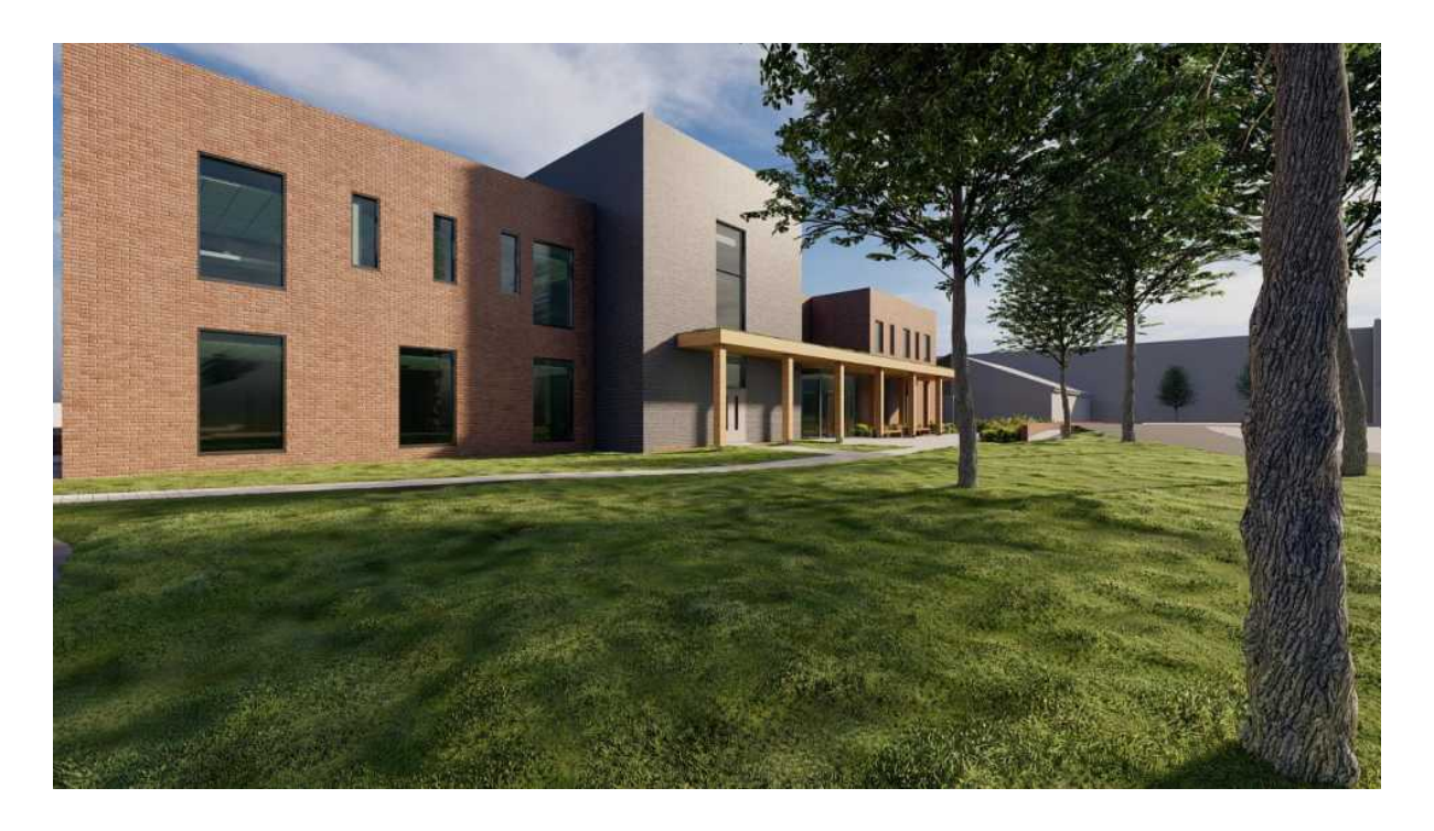
Mansfield CDC front elevation #2