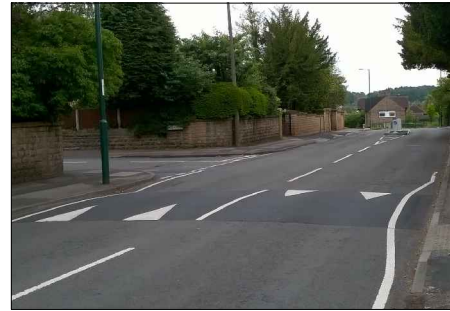
Modified Rolled Top Speed Cushion