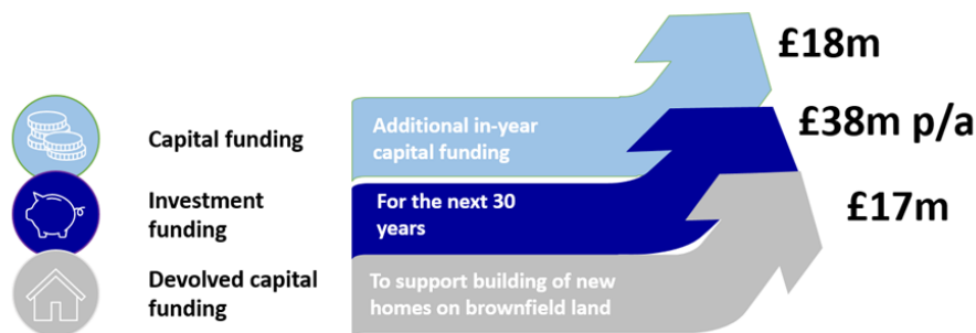
Figure 1: Devolution Deal Funding Summary