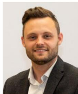
Cllr Ben Bradley MP

However, it is important that we continue to take the time to reflect on the progress we are making towards achieving our ambitions and to celebrate what has gone well during the last 12 months. This document provides a summary of what we have delivered, working together as one council, during 2022-23. For more information you can read the more detailed Annual Report for 2022-23.