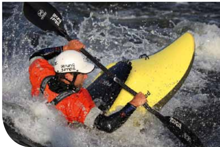
National Water Sports Centre