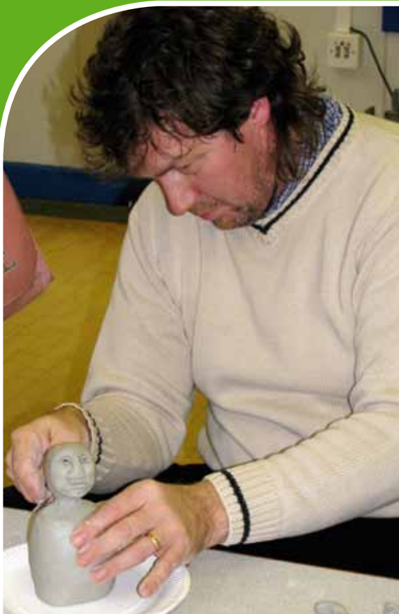
The Adult and Community Learning Service

The progress of the Cultural Strategy and the Service Cultural Action Plans will be monitored and reviewed on an annual basis and reported to Council.