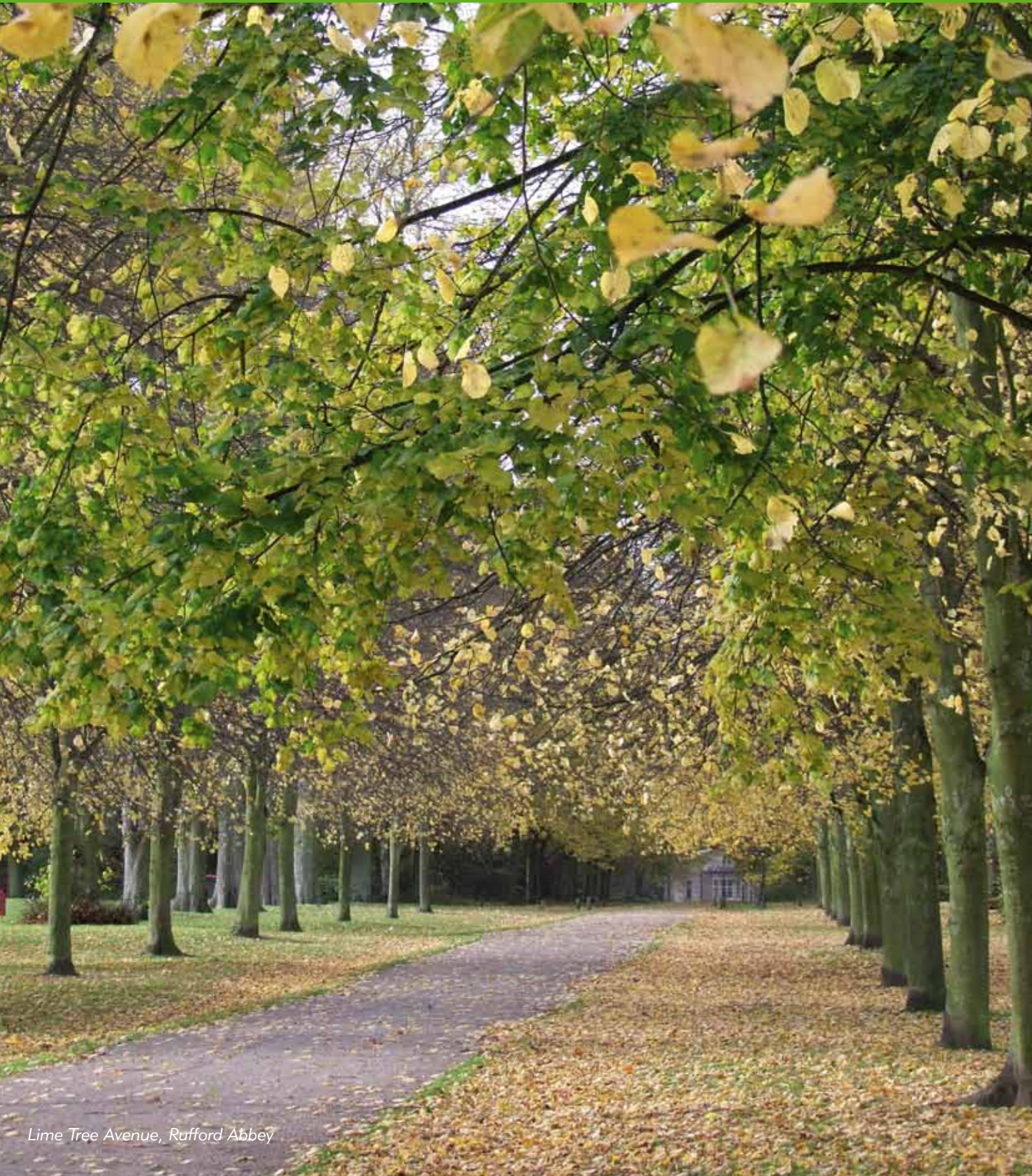
Lime Tree Avenue, Rufford Abbey