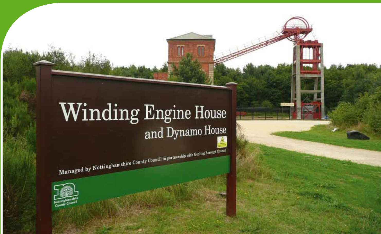
The Winding Engine House at Bestwood Country Park