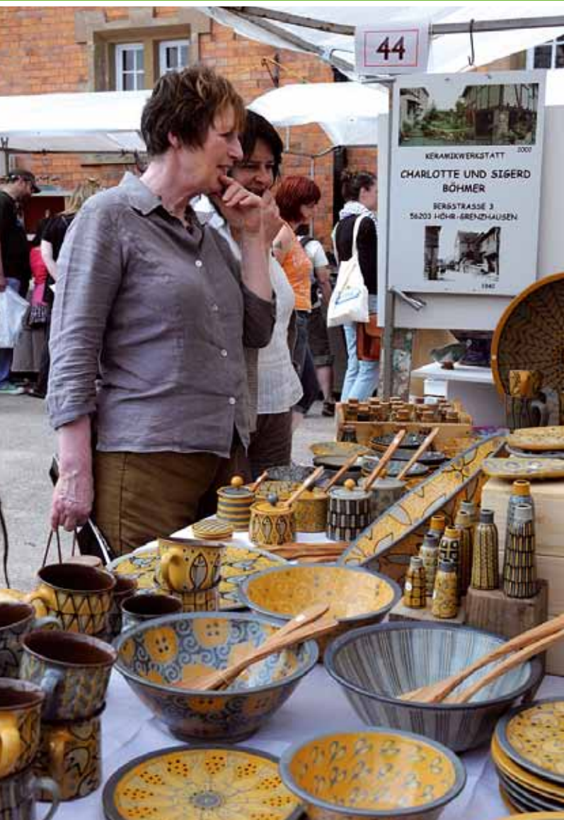
Craft at Rufford Country Park

It follows that a key measure of the success of our Strategy will be its contribution to building healthier, more vibrant and thriving Nottinghamshire communities and economy.