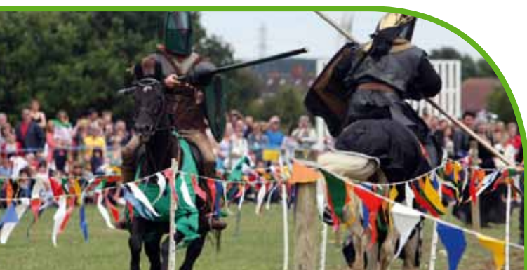
Jousting at the Robin Hood Festival

The history and heritage of the County is strengthened through its association with the Pilgrim Fathers, the English Civil War, Byron and Lawrence.