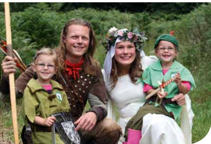
Robin Hood Festival